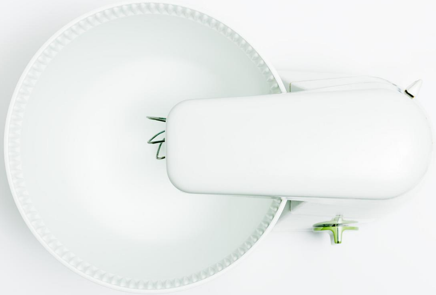
Final Image – Dodge Front Face