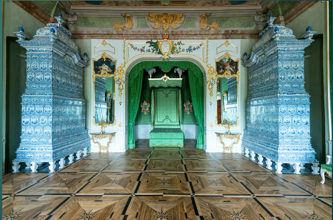
Rundale Palace, Bauska Municipality, Latvia – September 2017.