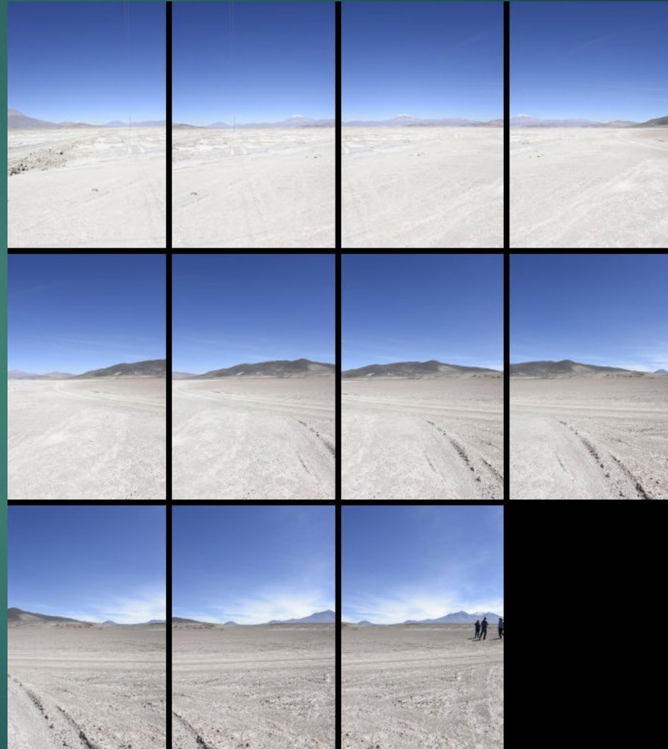
11 individual shots - Salar de Chiguana, Bolivia – February 2019.