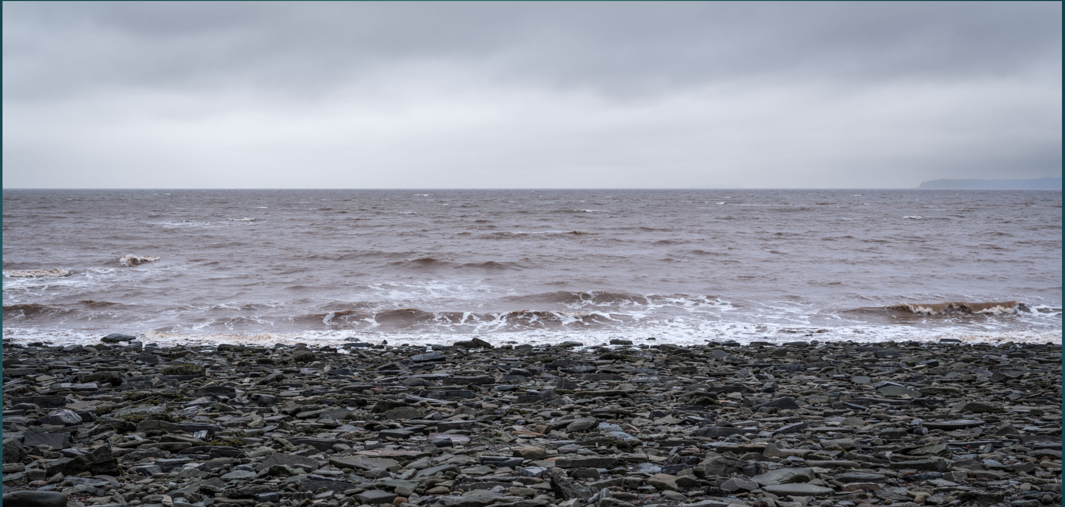
Bay of Fundy, Joggins, Nova Scotia – October 2025.