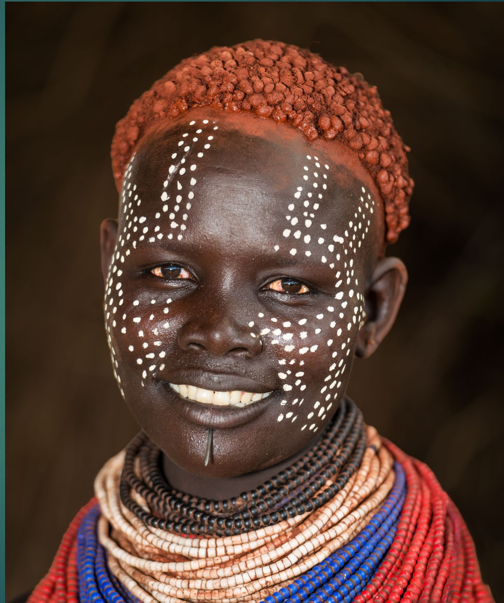
Karo Woman, Omo River Valley, Ethiopia – November 2013.