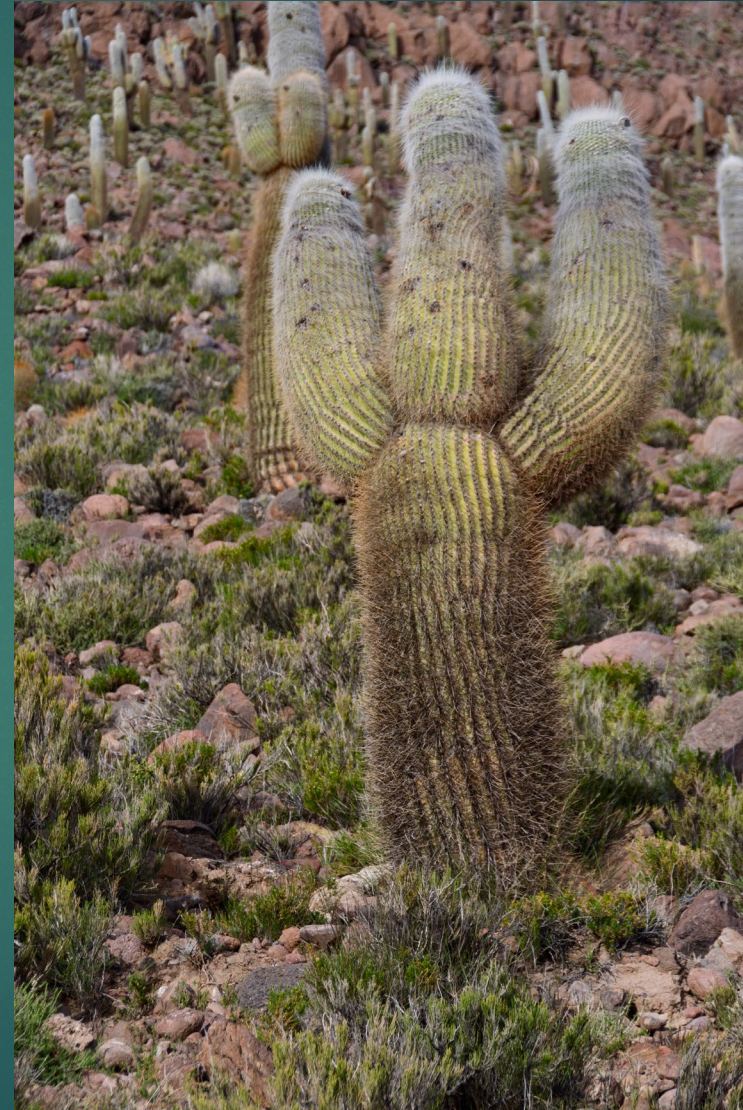
Cardón Cacti, Nuevo Amanecer, Bolivia – March 2019