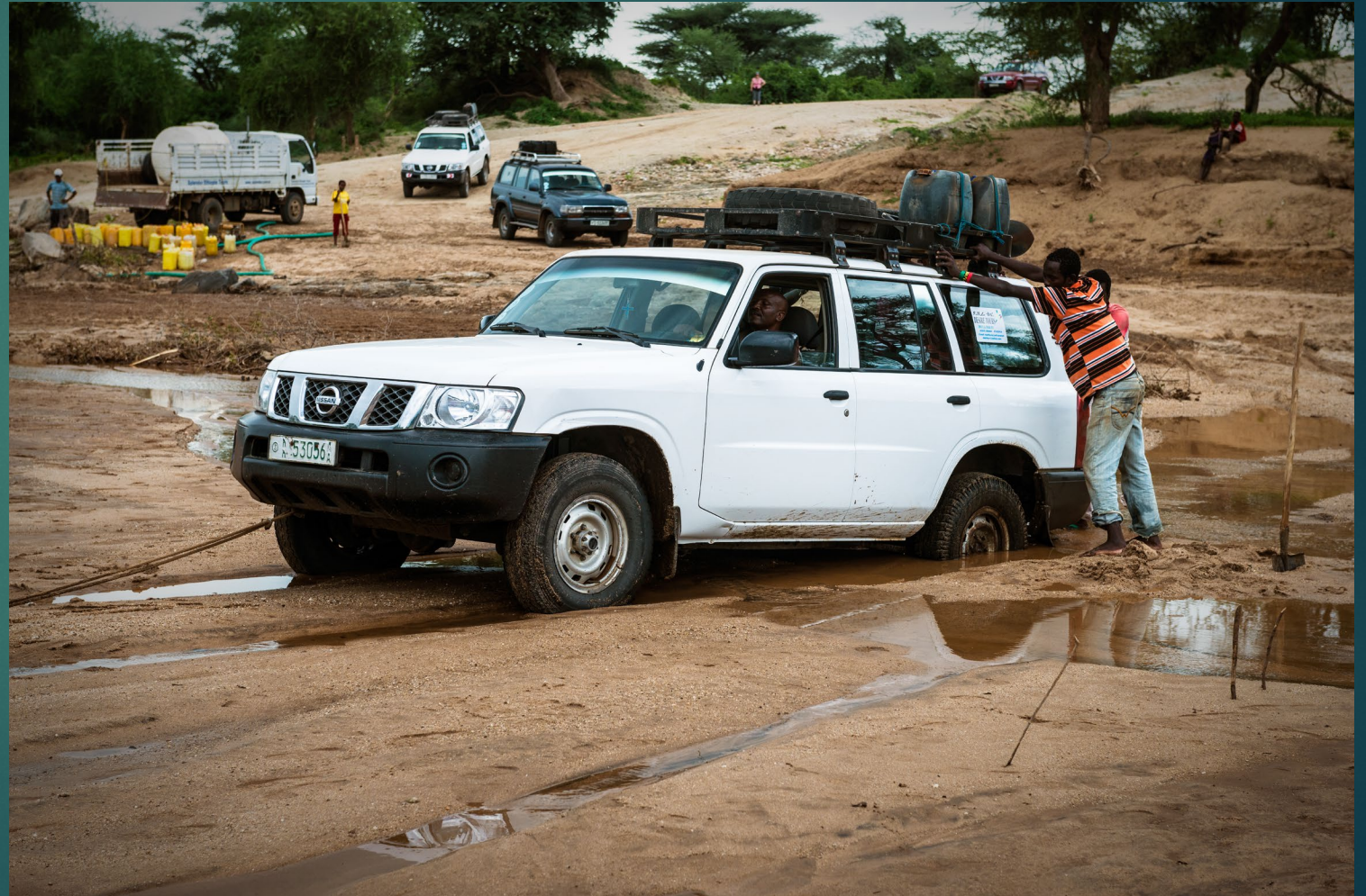
Unsuccessful River Crossing, Southern Ethiopia – November 2013.