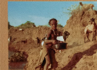
Nyendite - a young girl from Dassanetch doing the daily chores