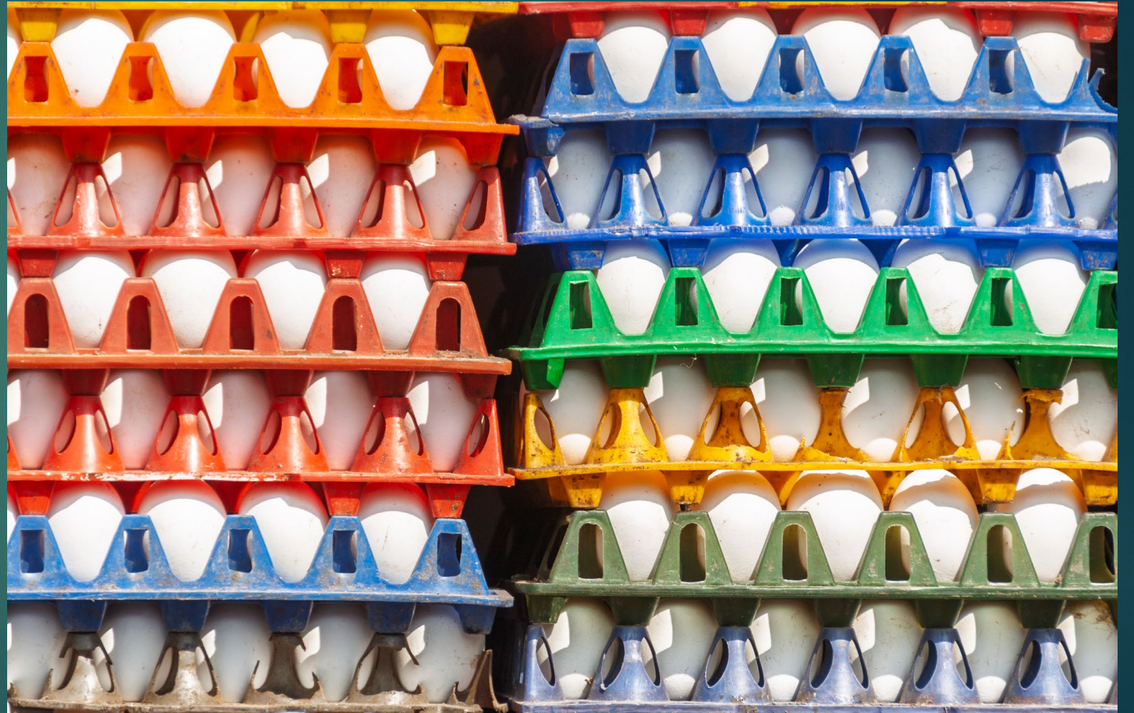
Eggs - Russell Market, Bangalore, Karnataka, India – March 2017