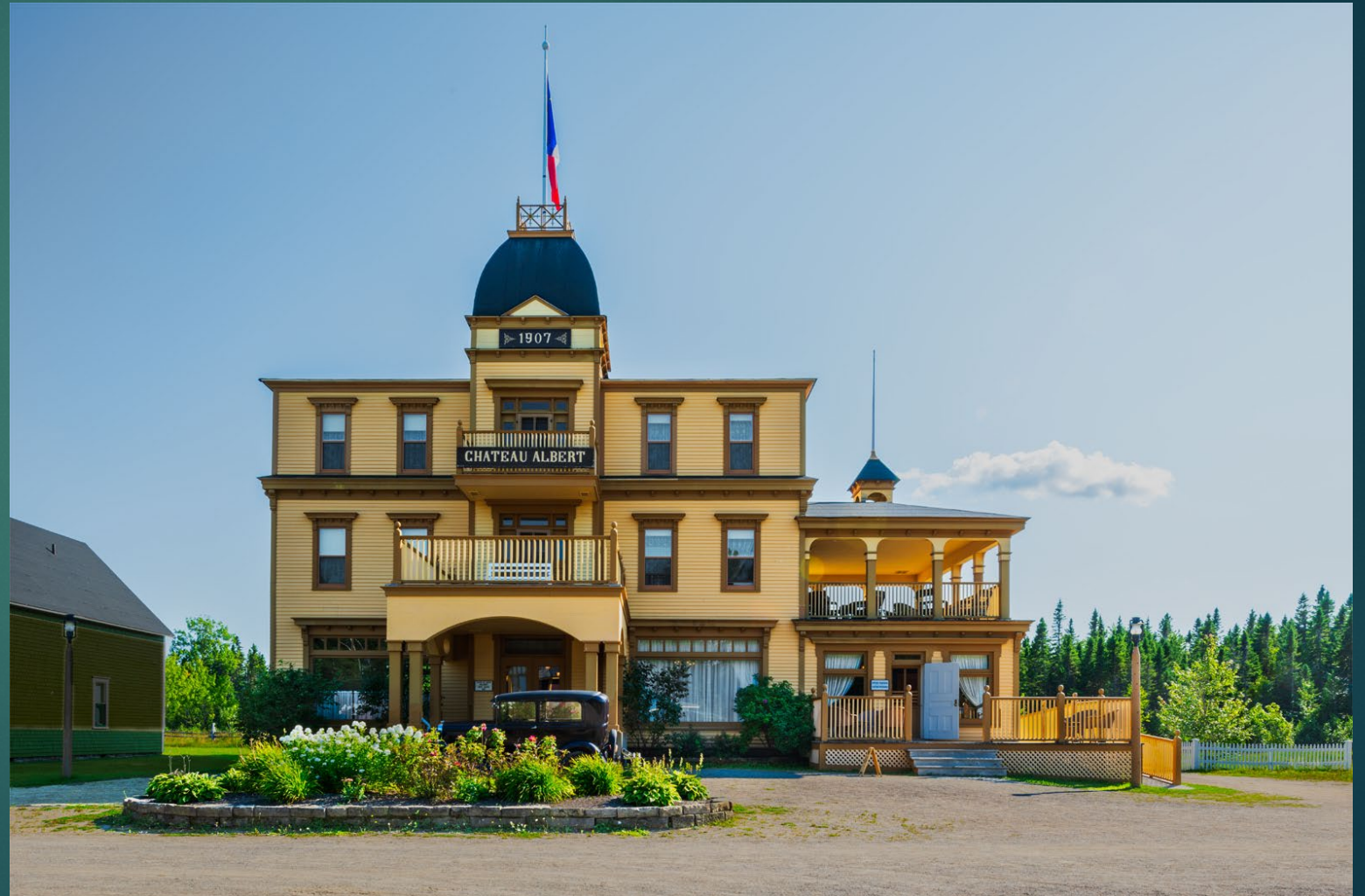
Château Albert Hotel, Village Historique Acadien, Bertrand, New Brunswick – September 2022.