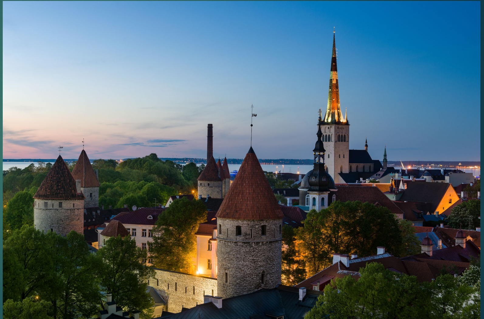
Old Town – Tallinn, Estonia – Golden Hour to Blue Hour – May 2016.