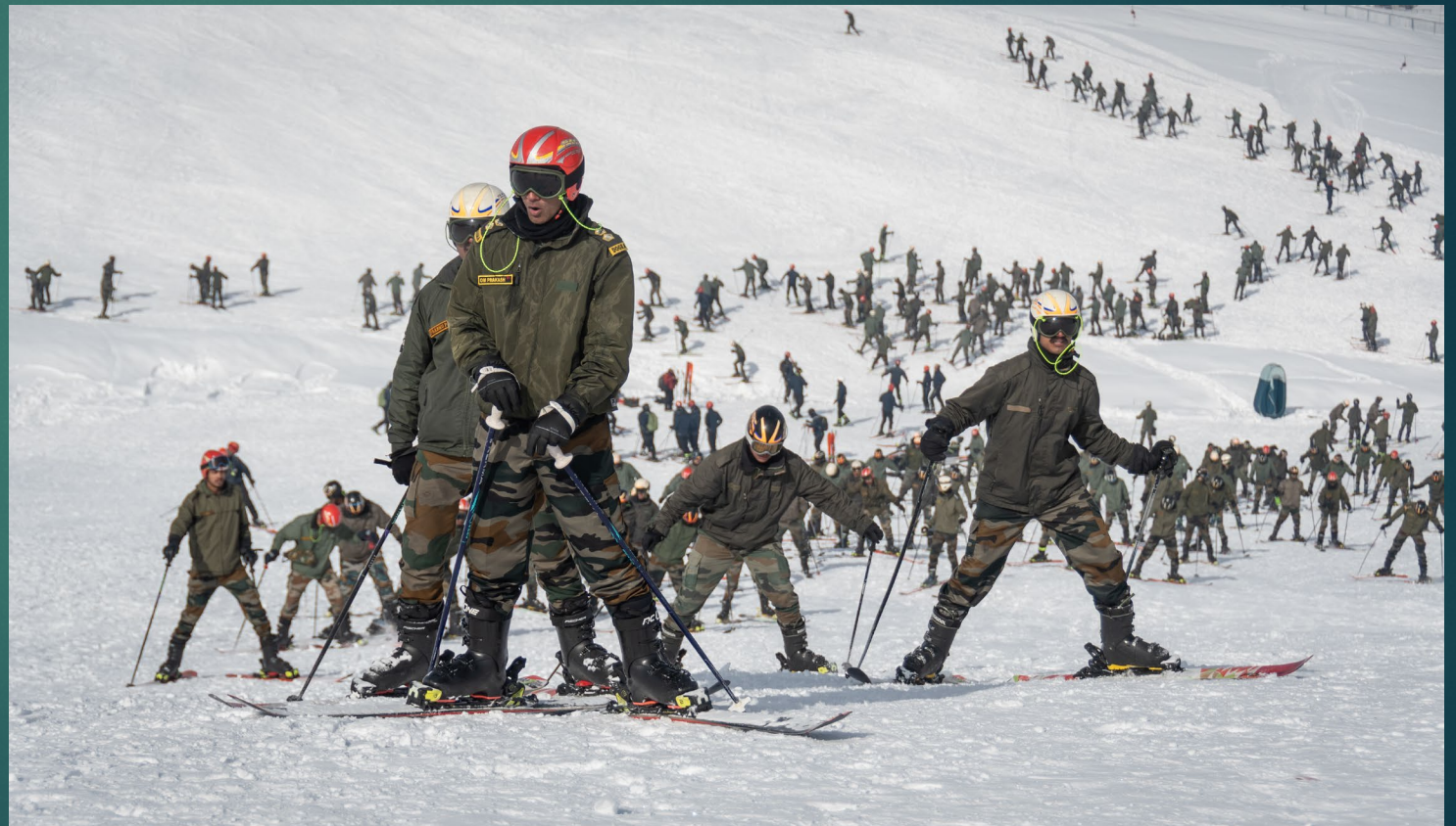
Indian Army High Altitude Warfare School (HAWS), Gulmarg, Kashmir, January 2023