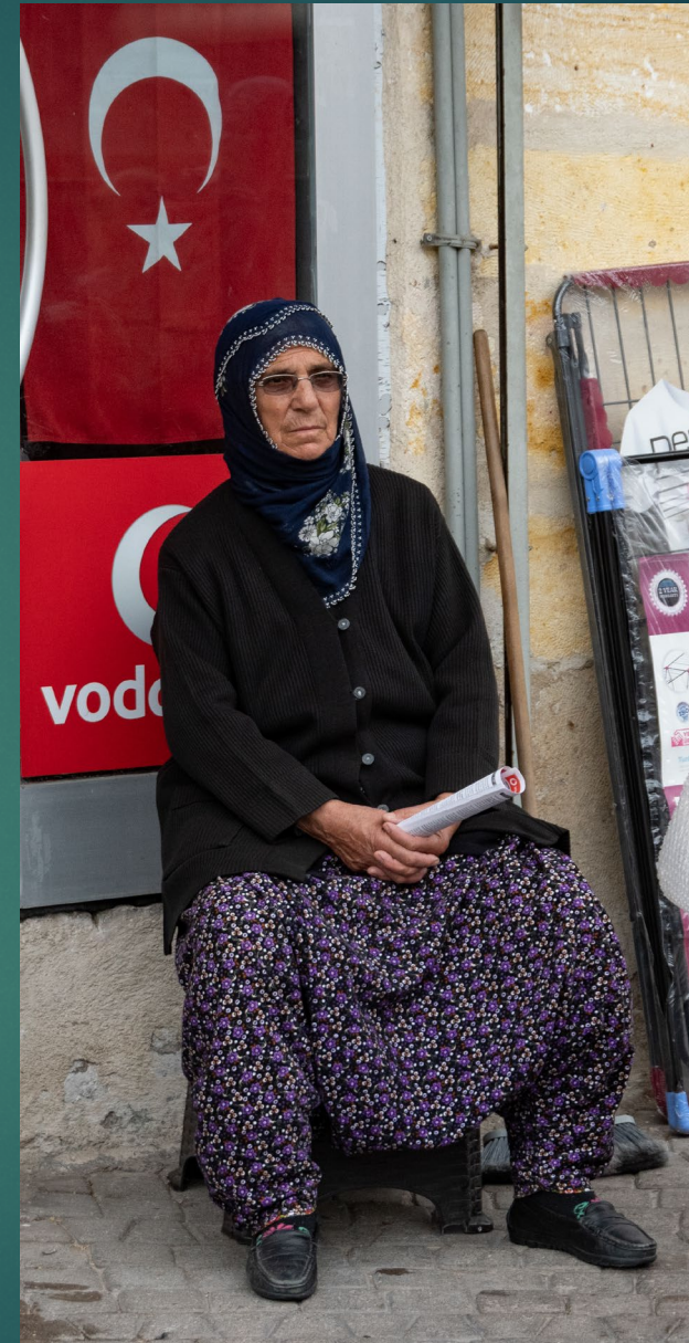
Man on Street, Turkey - 2023