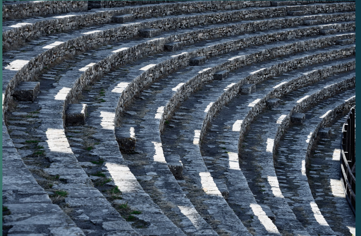
Pula Arena, Pula, Croatia – September 2025.