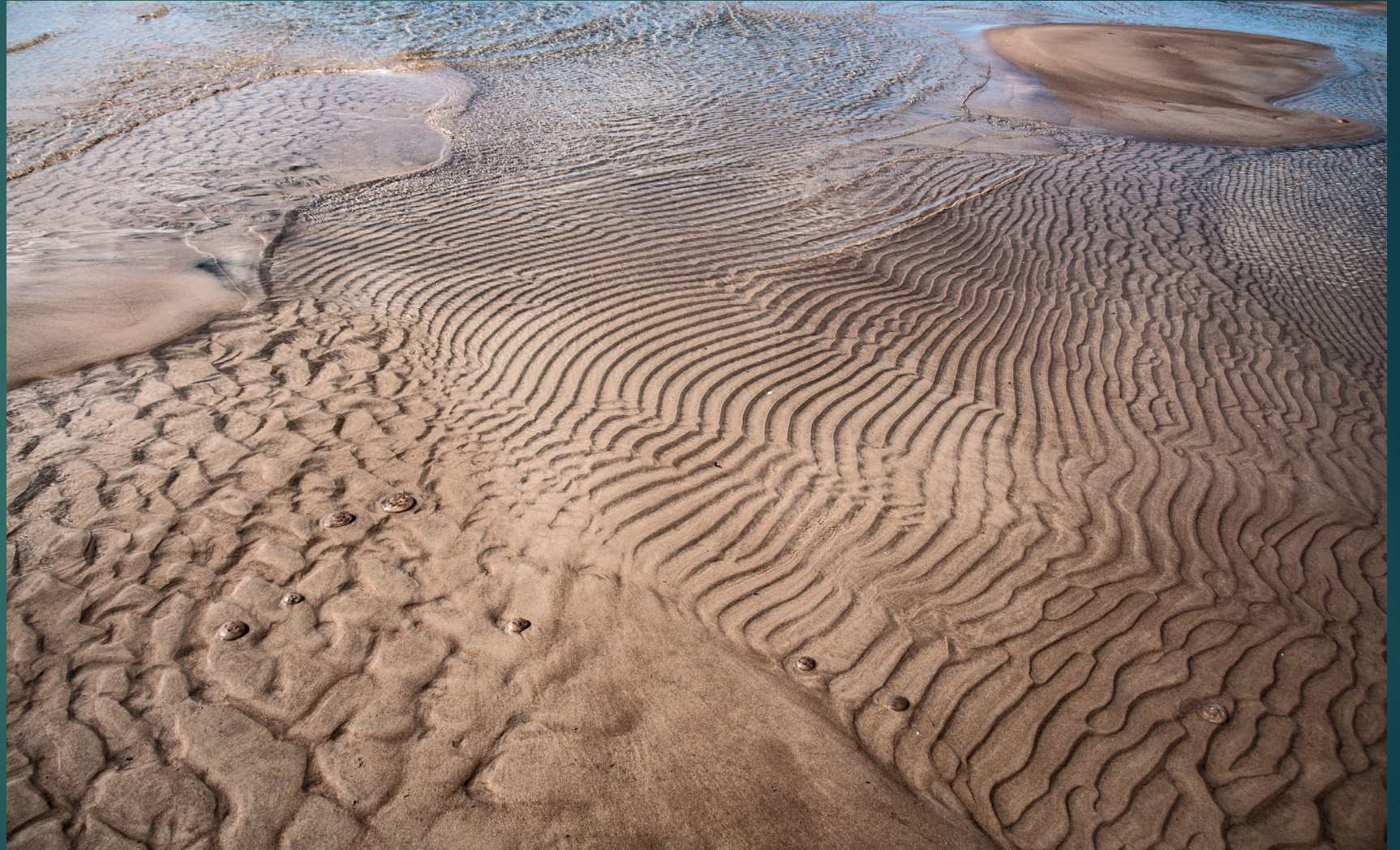
Baltic Sea Shoreline, Saaremaa Island, Lithuania – September 2017