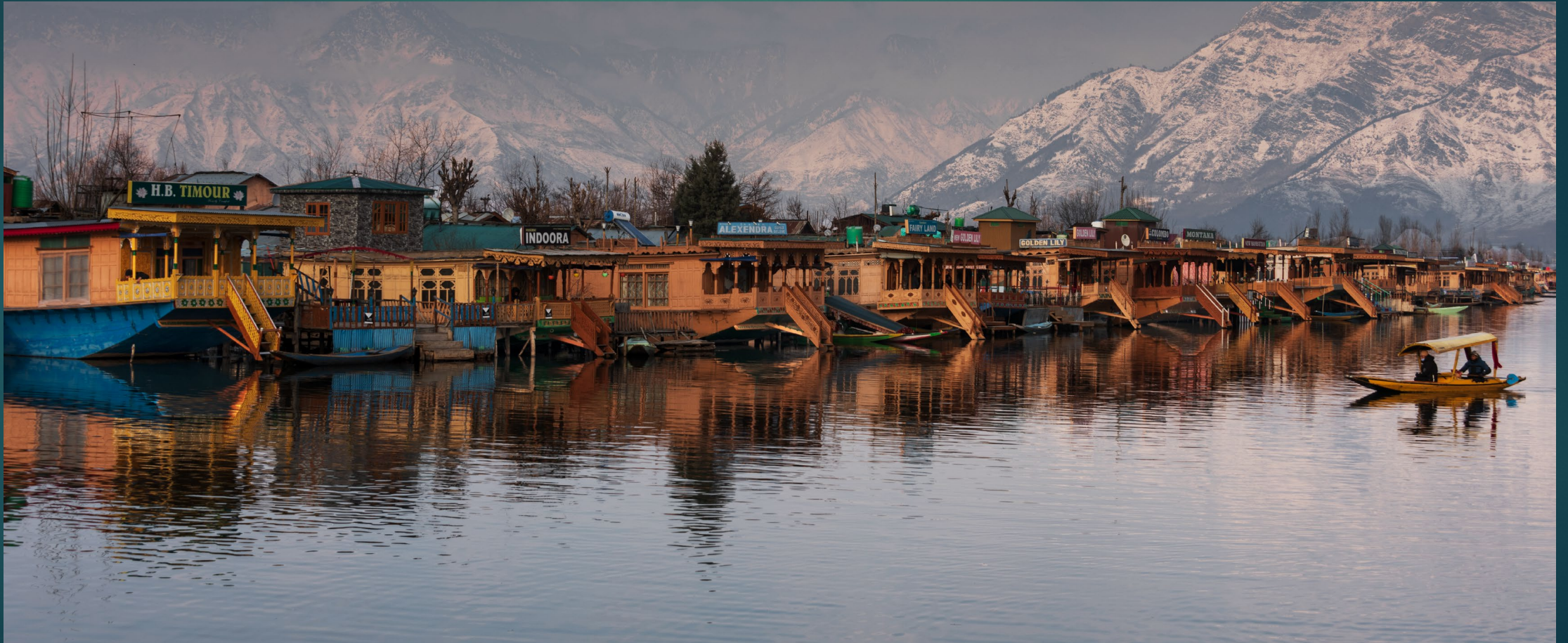
Houseboats on Dal Lake, Srinagar, Kashmir, India – January 2023.