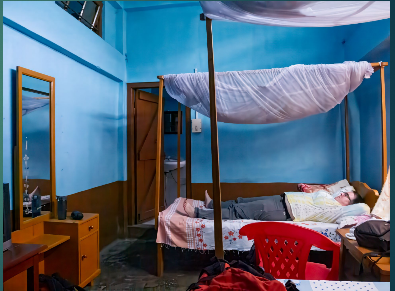
Hotel Room – Northern Arunachal Pradesh, India – November 2014.