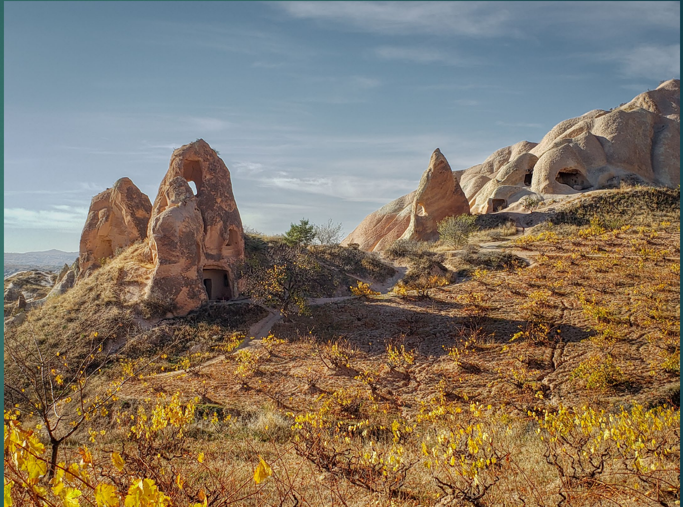
Cappadocia, Turkey, November 2023