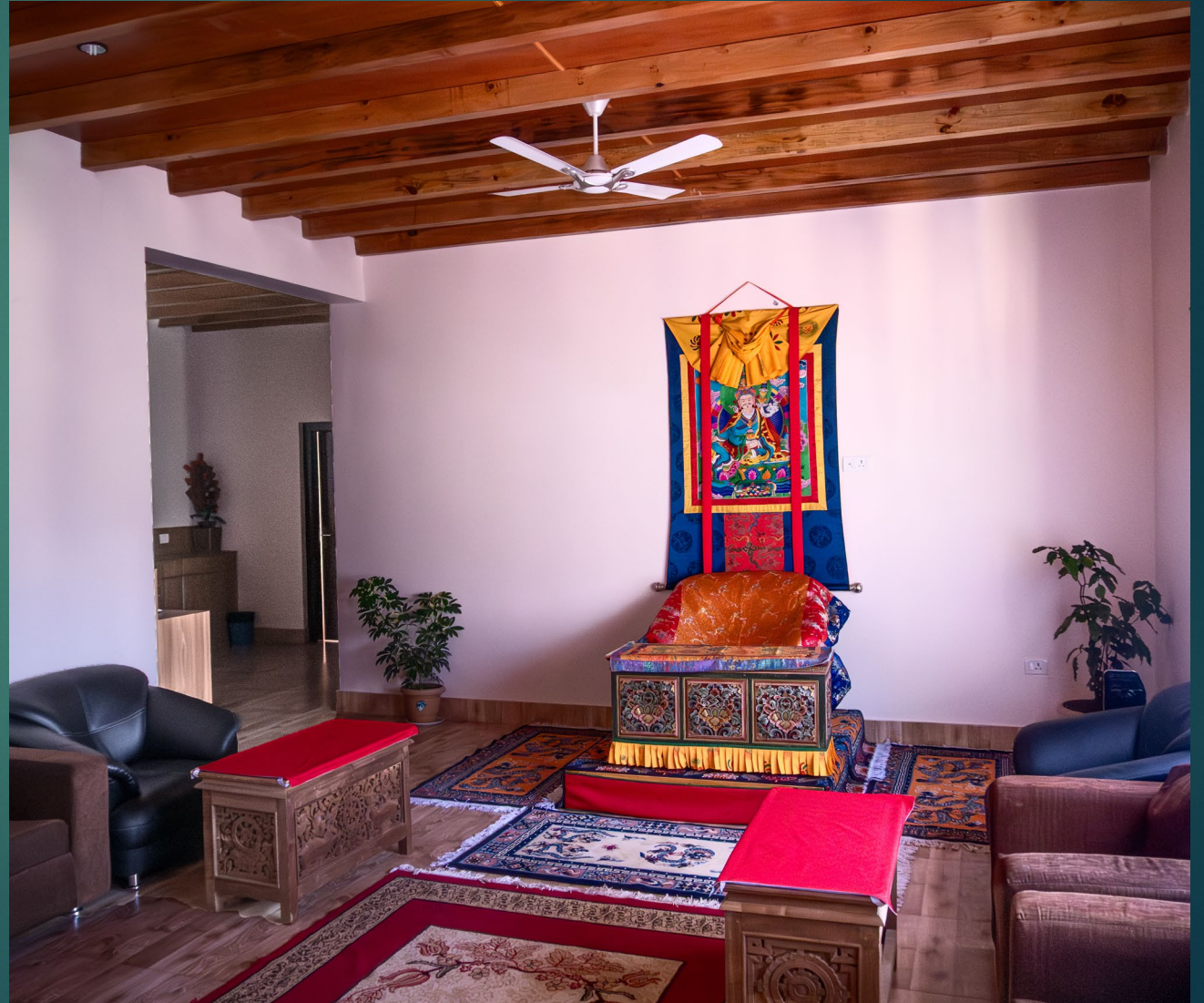
Hotel Suite with Throne, Trashigang, Bhutan – October 2014.