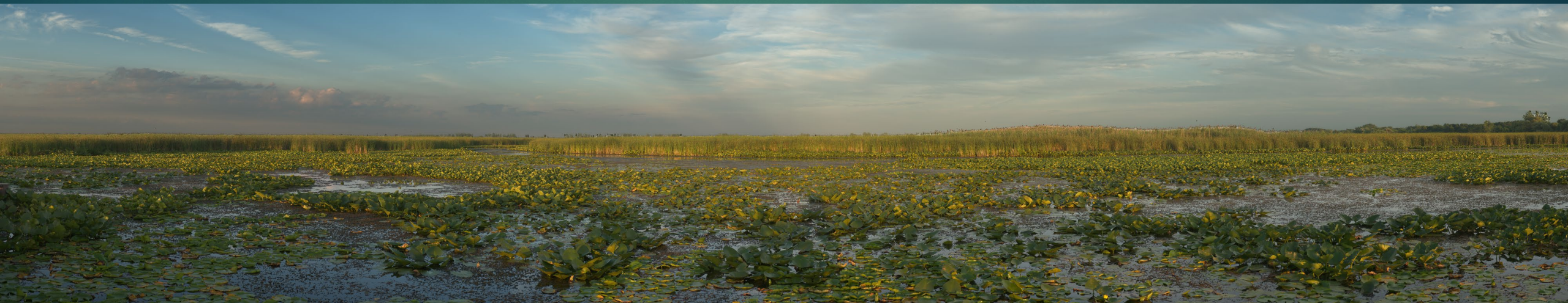
Point Pelee National Park , Ontario - Panorama – After the Storm – July 2015.