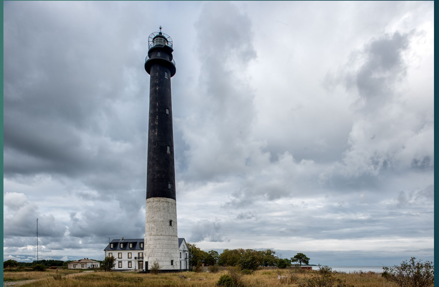
Saare Lighthouse, Saaremaa Island, Estonia – September 2017.