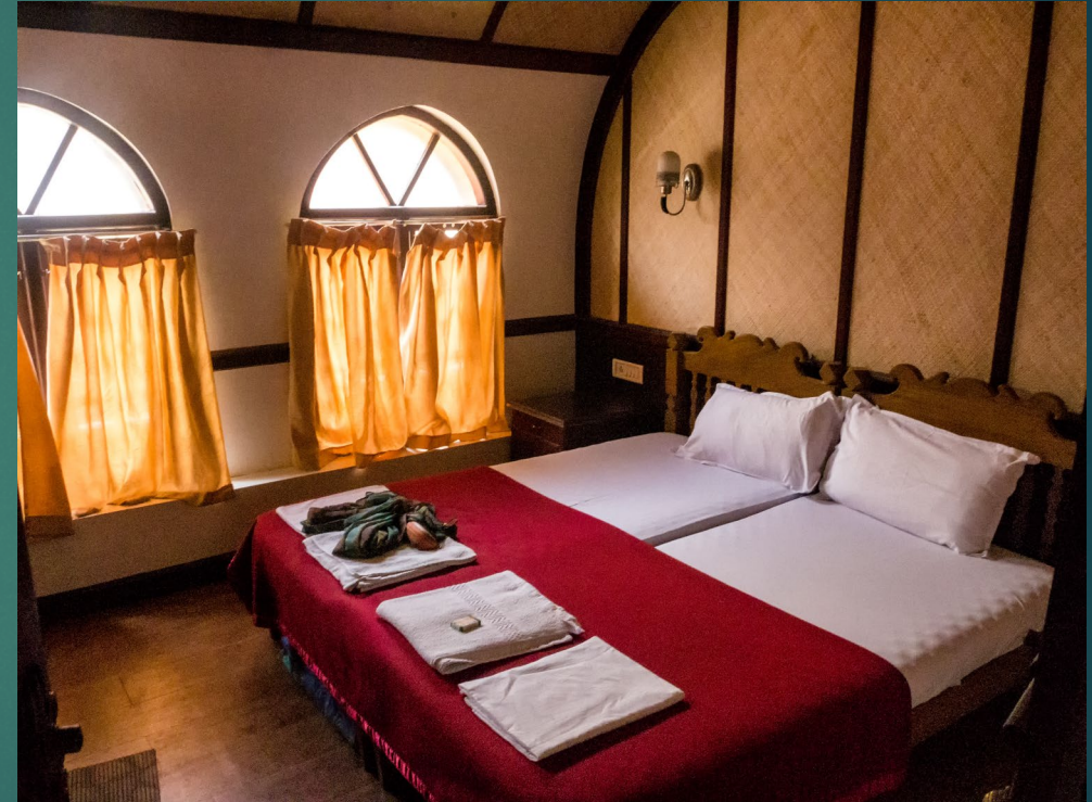
Houseboat interior, Alleppey, Kerala, India – February 2016.