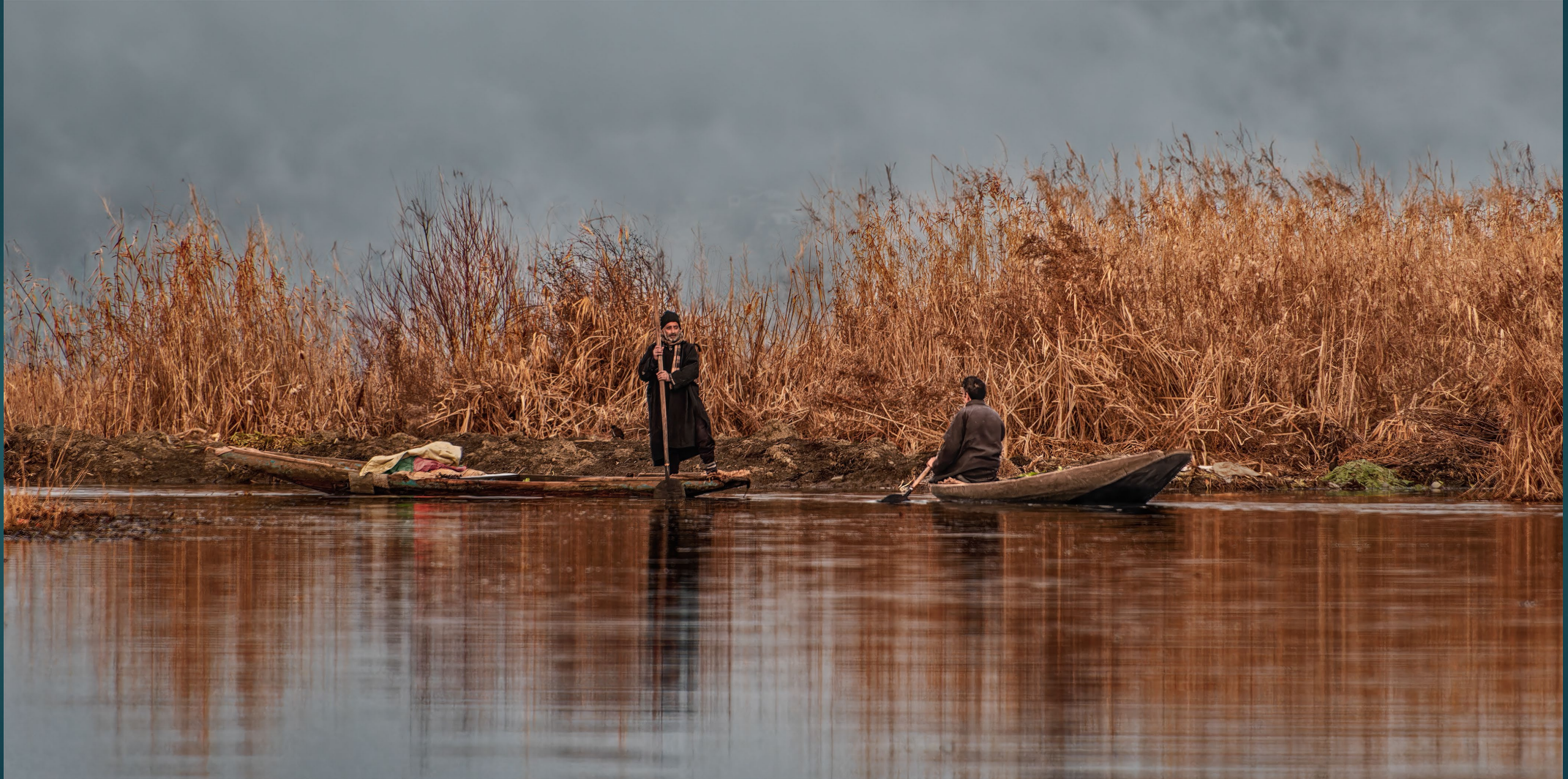
Two Men in Shikaras, Dal Lake, Srinagar, India- administered Kashmir, January 2023.