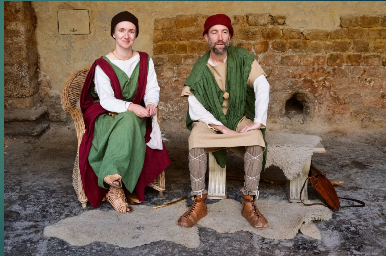
Interpreters – Roman Baths, Bath, England – September 2024