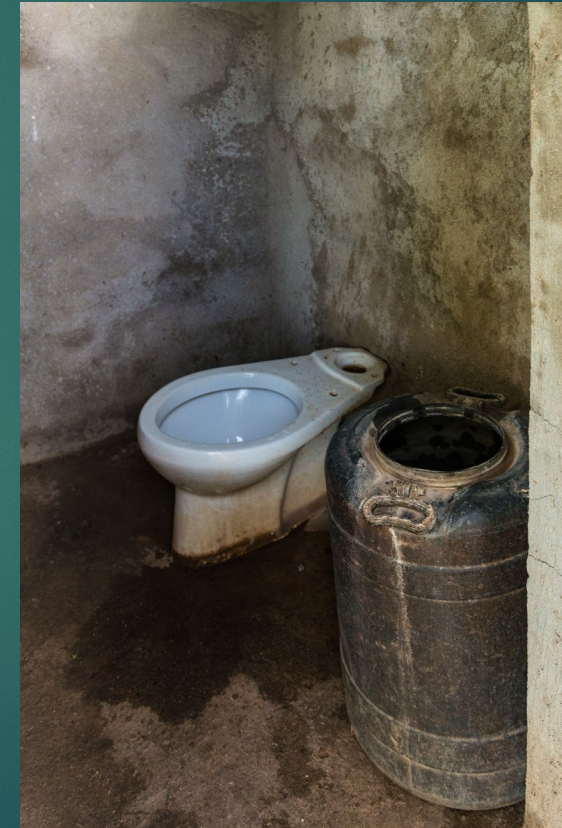
Toilet Facilities, Southern Ethiopia – November 2023.