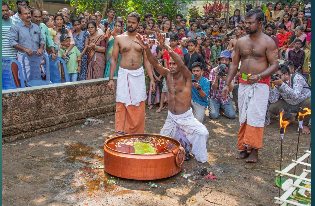
Sacrifice – Theyyam, Kerala, India – February 2023