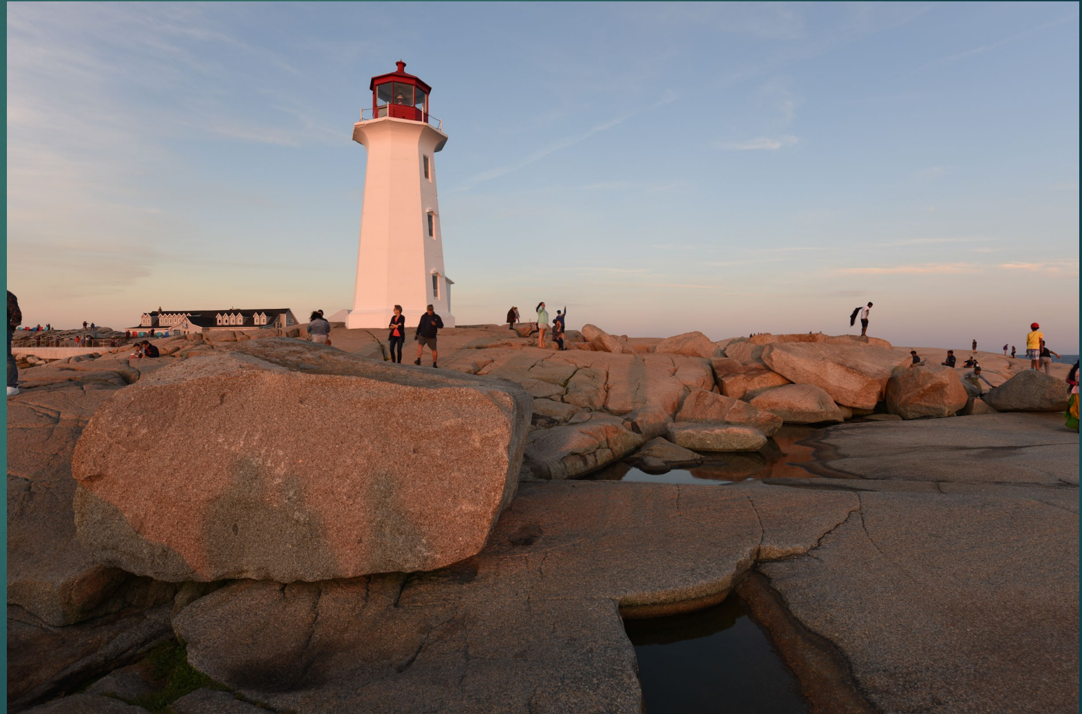
Lighthouse, Peggy's Cove, NS – September 2022.