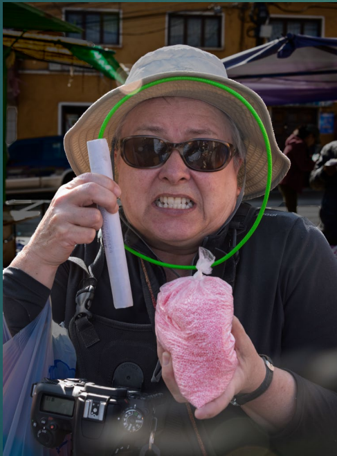
Dynamite and Accelerant - Potosi Miner's Market, Bolivia – March 2019.