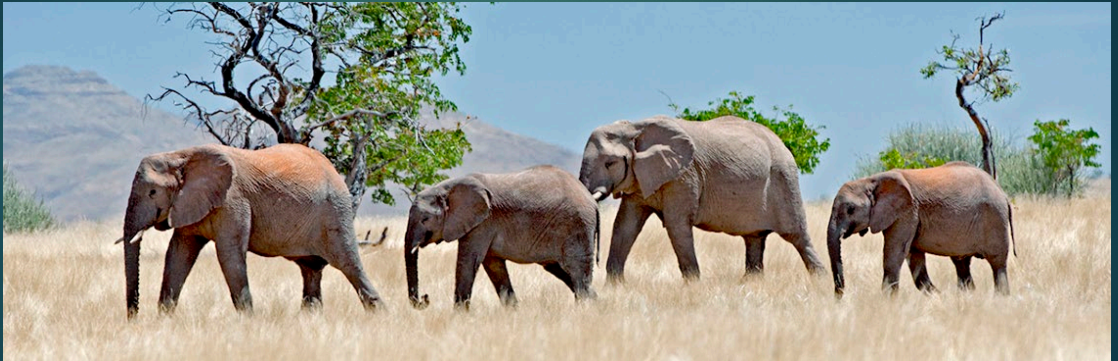
Desert Elephants, Palmwag, Namibia – November 2011.