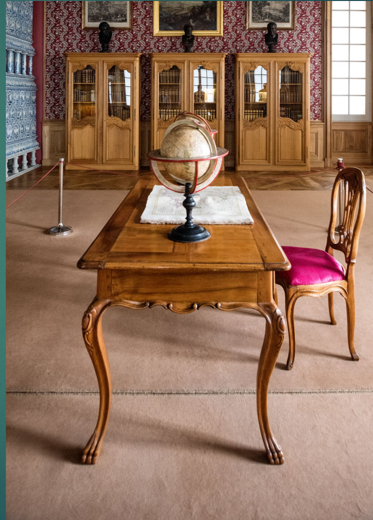
Rundale Palace, Bauska Municipality, Latvia – September 2017.