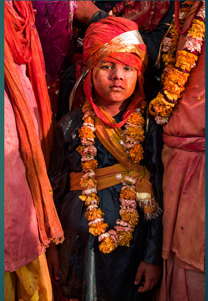
Hindu Pilgrims, Lathmar Holi, Nandgaon, Uttar Pradesh, India – March 2017.