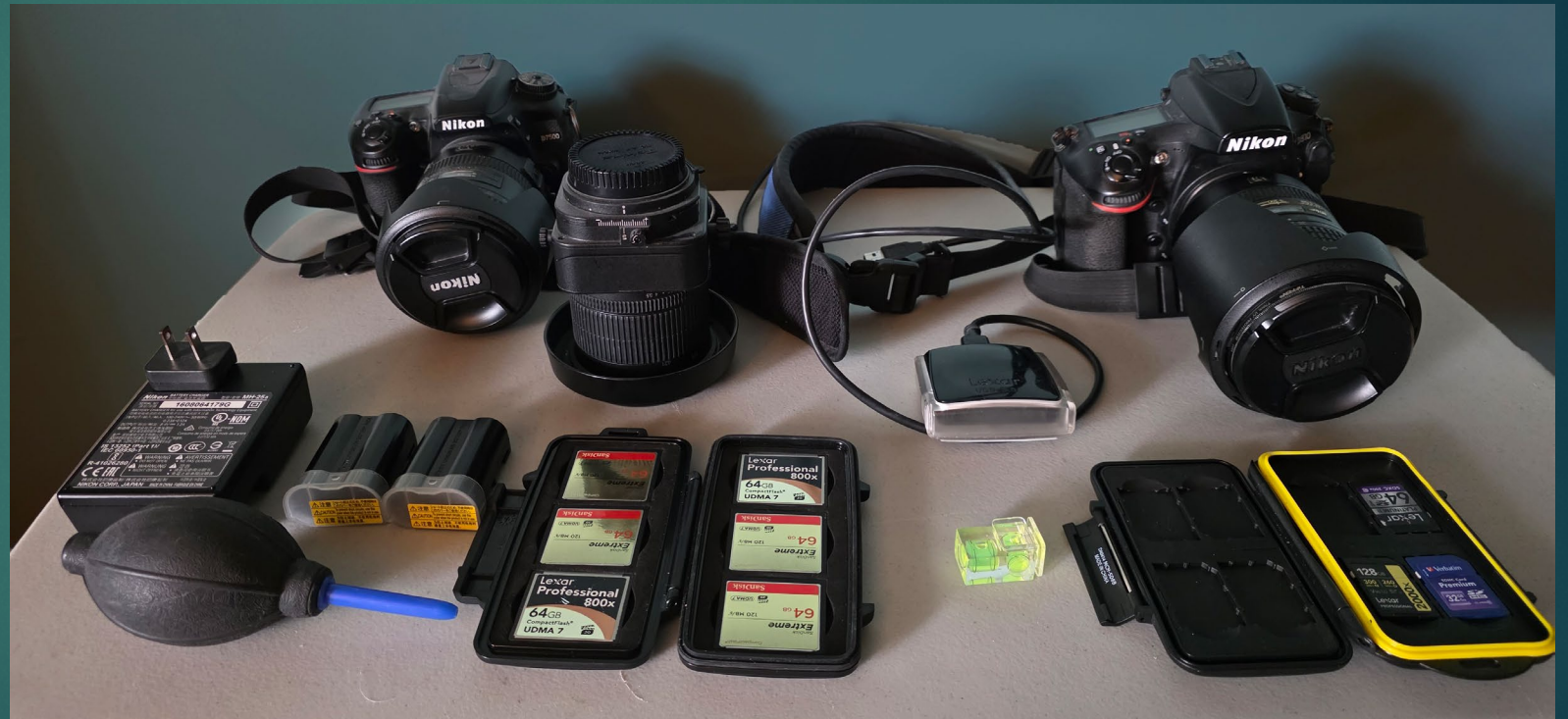
Equipment taken on September 2025 trip to the Balkans.