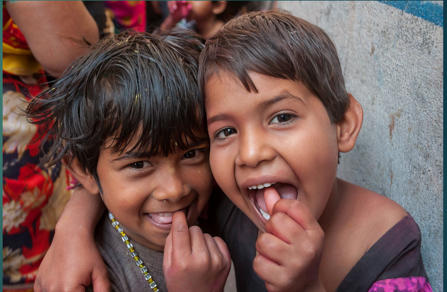
Two Children, Nandgoan, Uttar Pradesh, India – March 2017