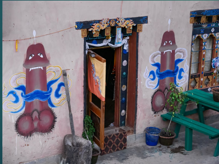
Store front, Punakha, Bhutan – October 2024.