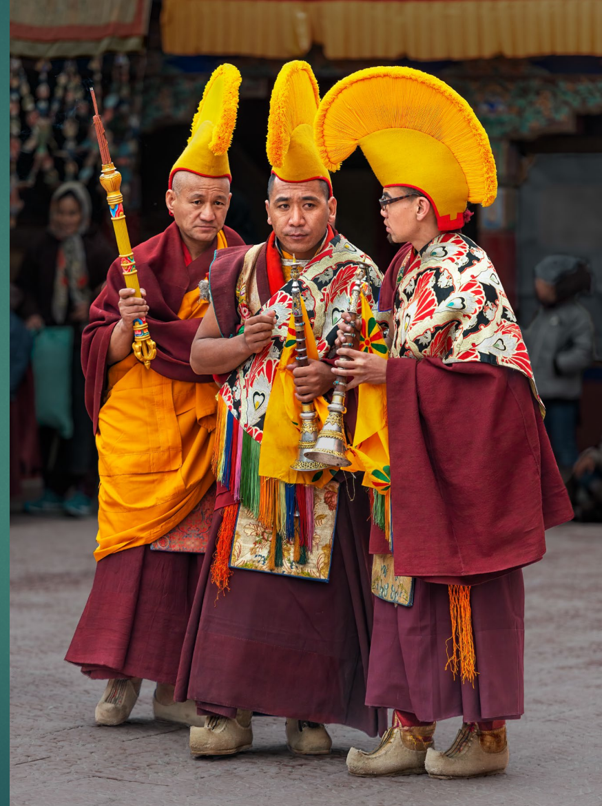
Gustor Festival, Spituk Monastery, Ladakh, India – January 2017.