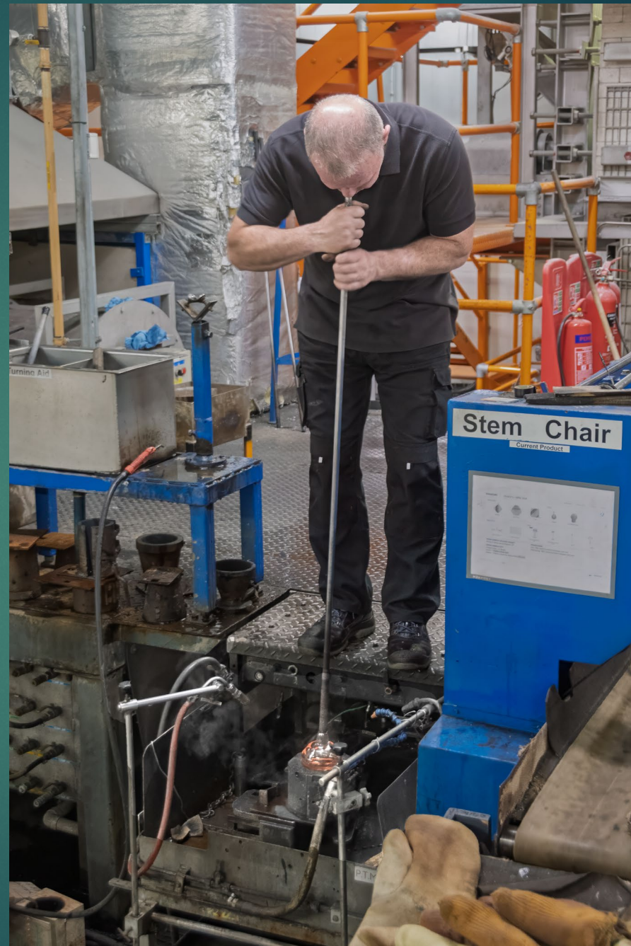
Blowing Waterford Crystal, Waterford, Ireland – October 2024