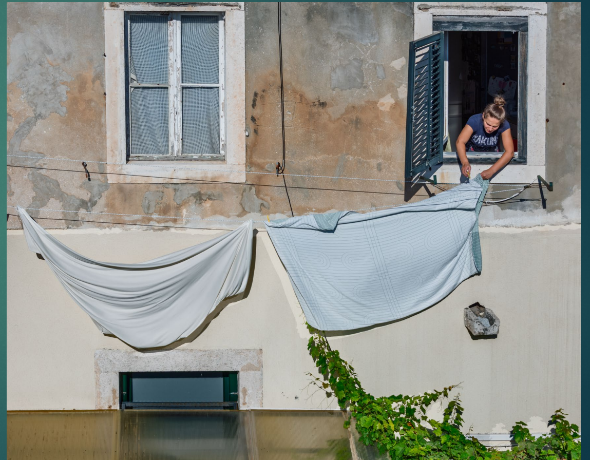
Laundry Day in Old Dubrovnik, Croatia – September 2025.