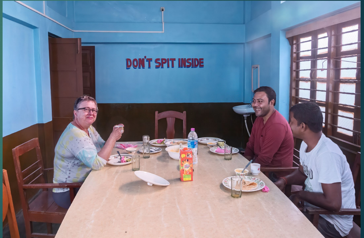
Restaurant – Northern Arunachal Pradesh, India – November 2014.