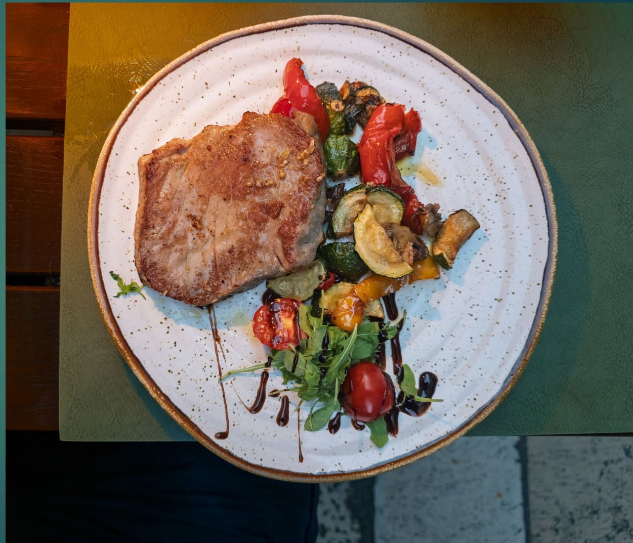
Dinner, Dubrovnik, Croatia - September 2025.