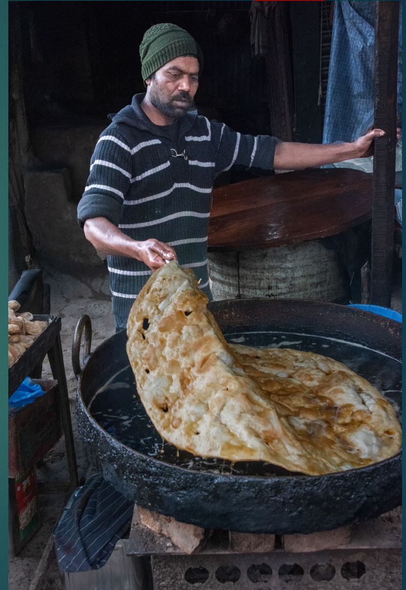
Street Food, Srinagar, Kashmir, India – January 2023.