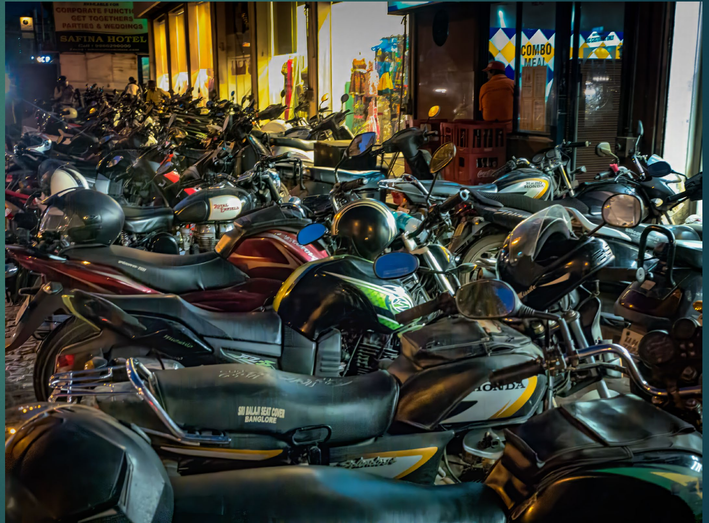
Parked Motorcycles, Safina Plaza, Bangalore, India – February 2016.