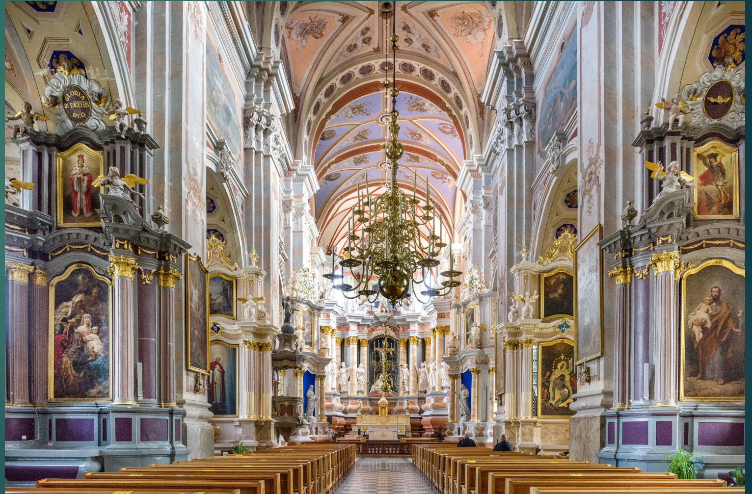
Kaunas Cathedral, Kaunas, Lithuania – September 2017.