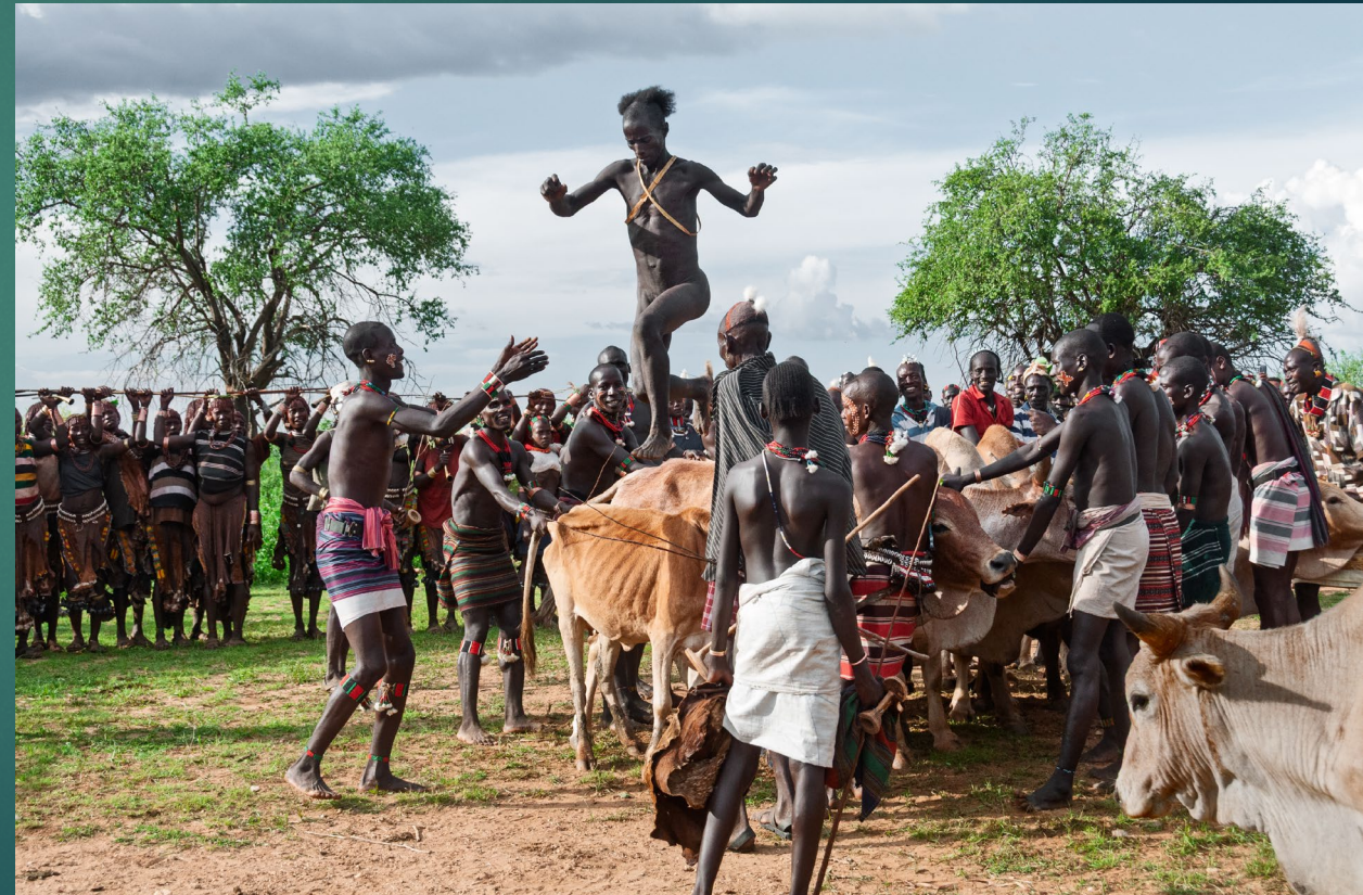
Bull Jumping, Omo Valley, Ethiopia – November 2013