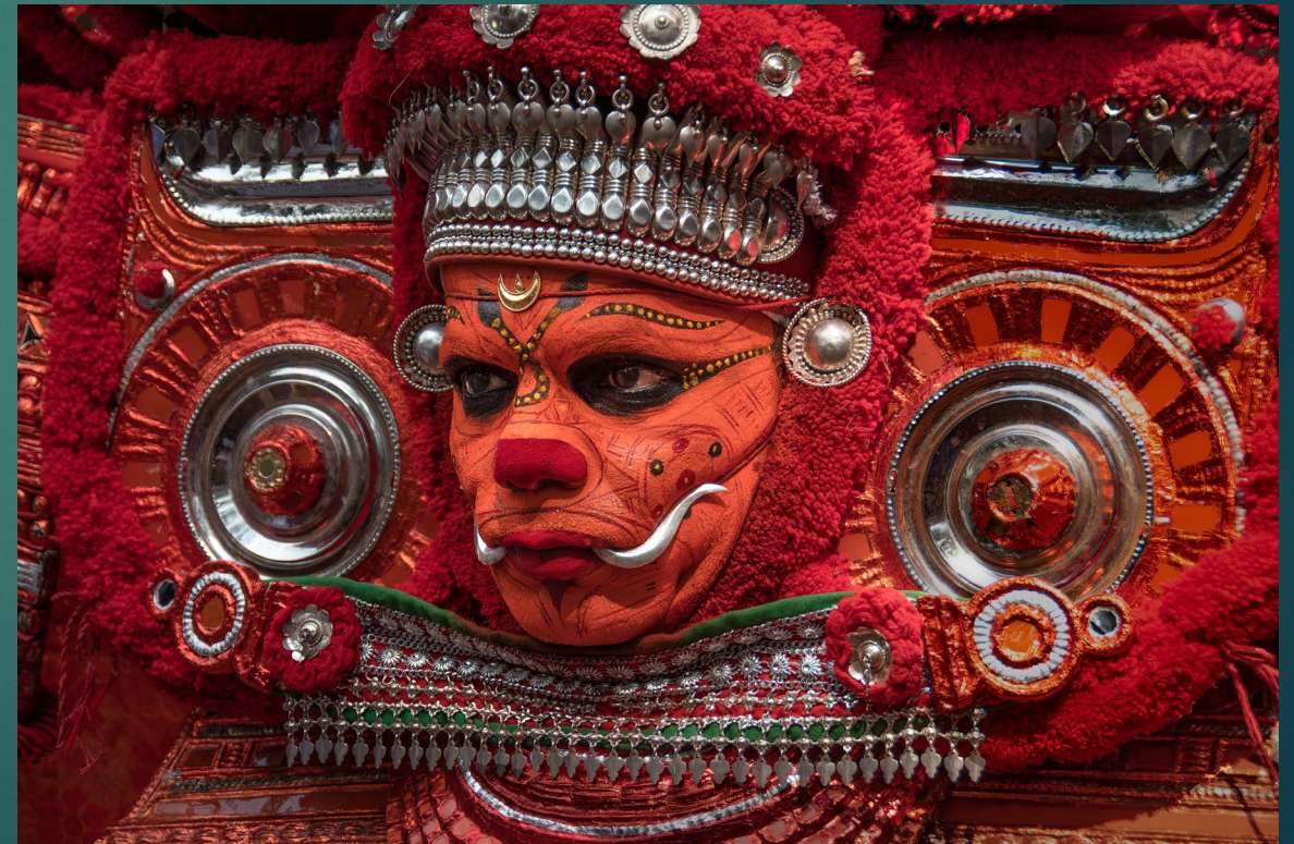
Theyyam, Kerala, India – February 2023