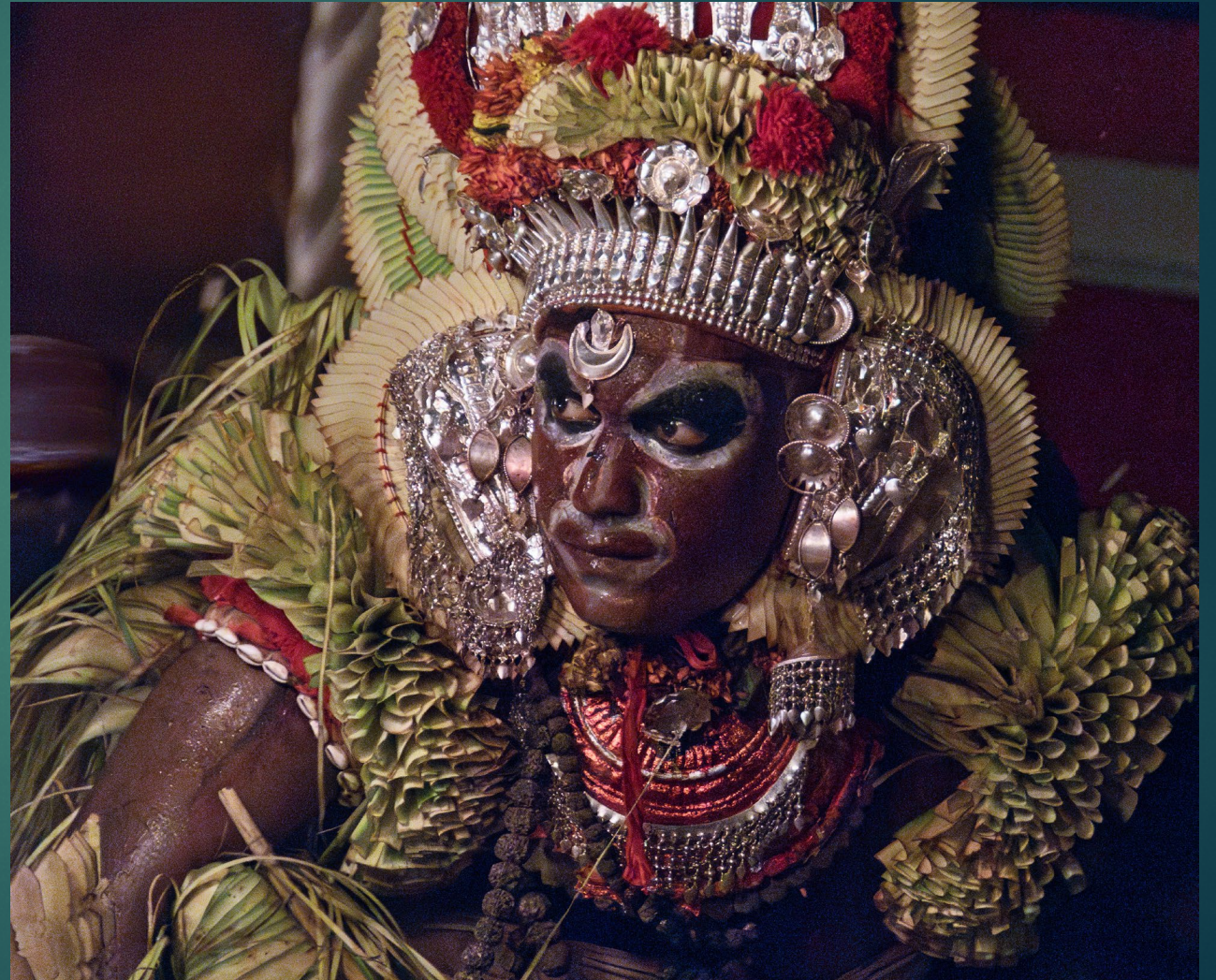
Demonic Theyyam, Kerala, India – February 2023