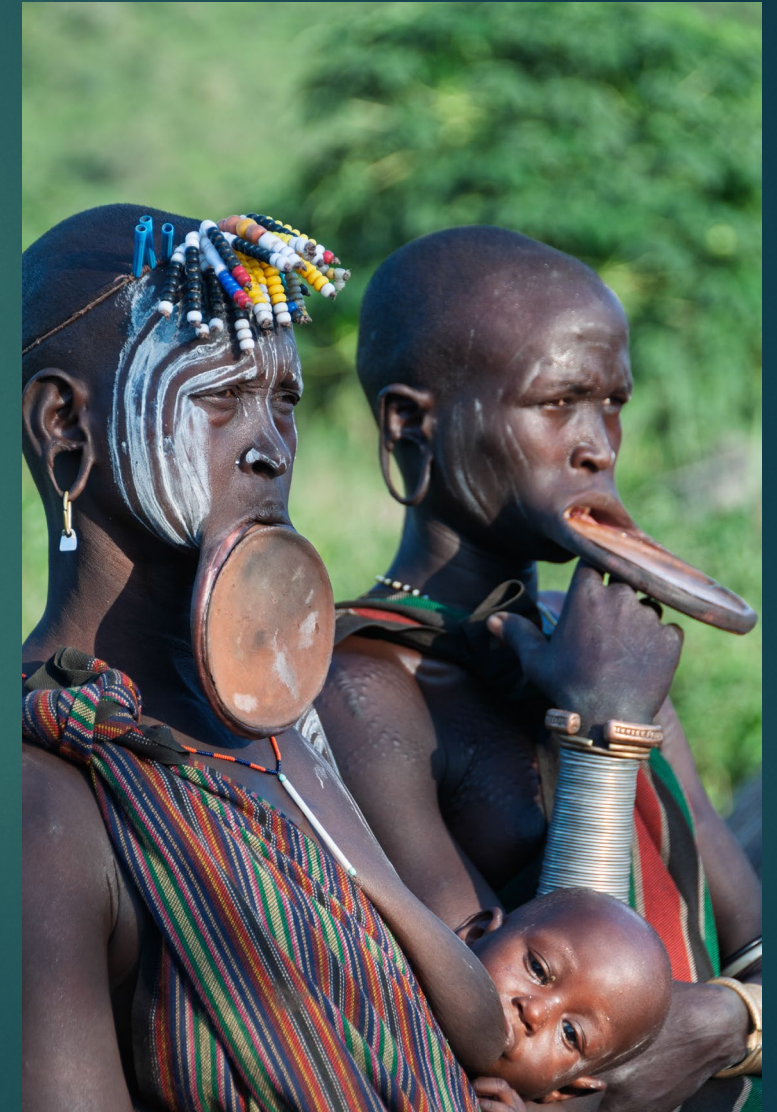
Mursi Women and baby – Omo Valley, Ethiopia – November 2013