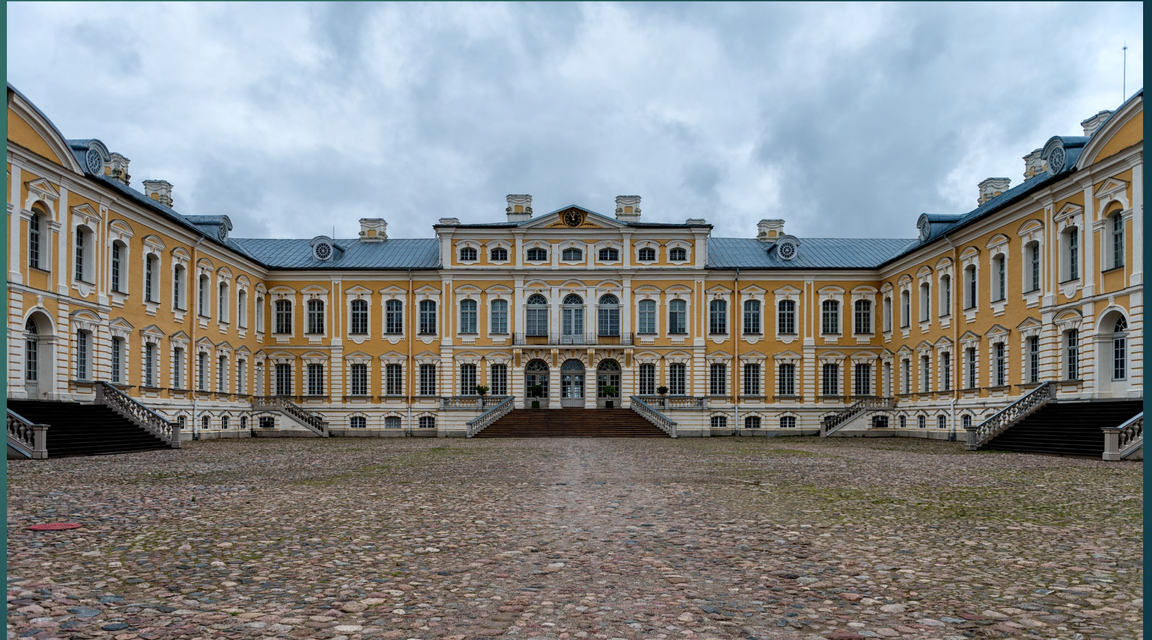
Rundale Palace, Bauska Municipality, Latvia – September 2017.