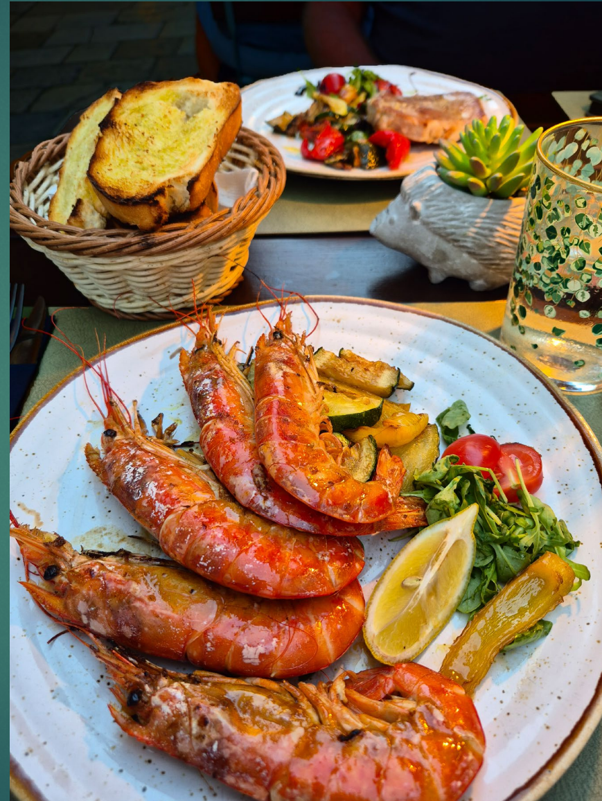
Scampi Dinner, Dubrovnik, Croatia - September 2025