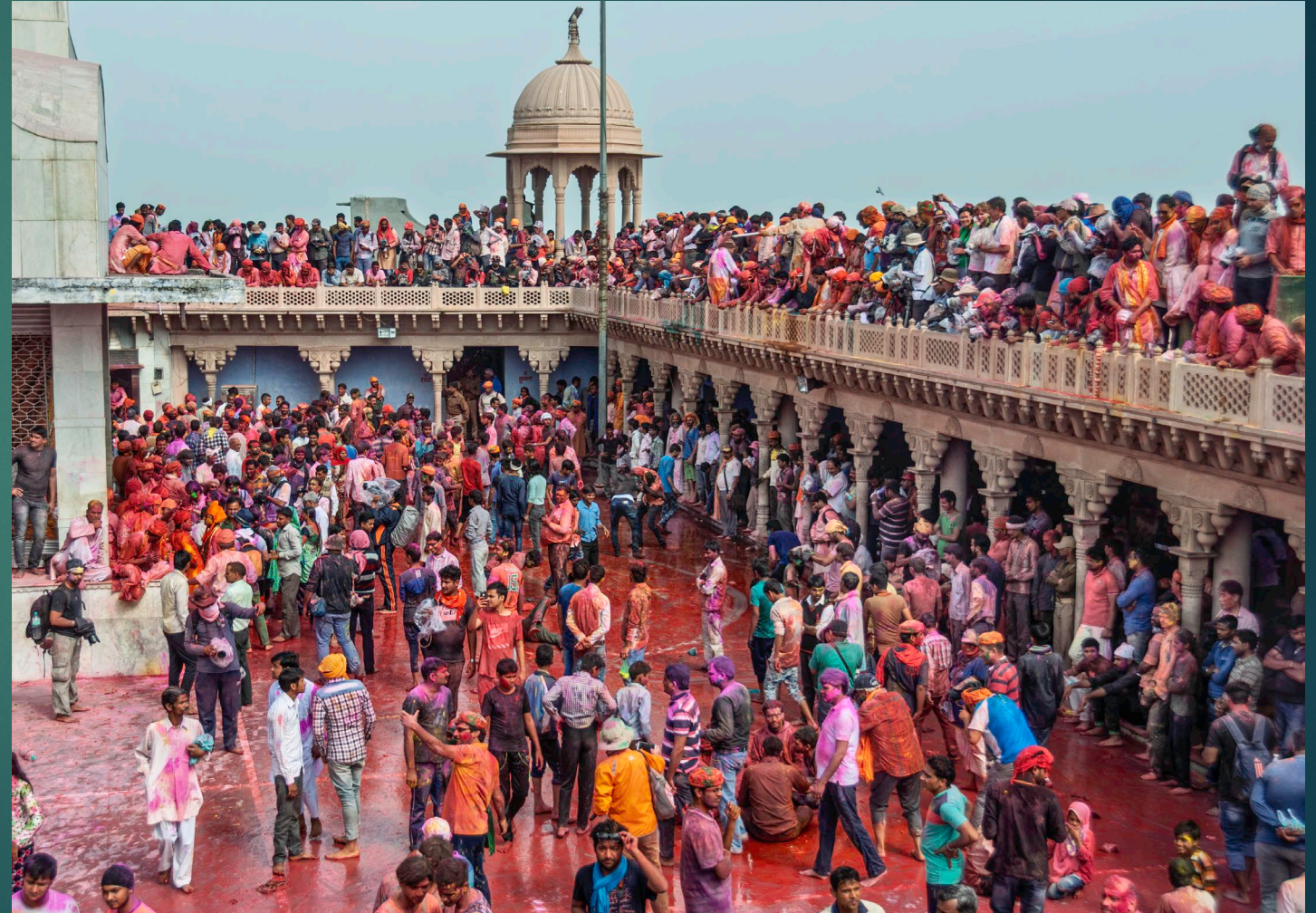
Holi at the Temple, Nandgaon, Uttar Pradesh, India – March 2017