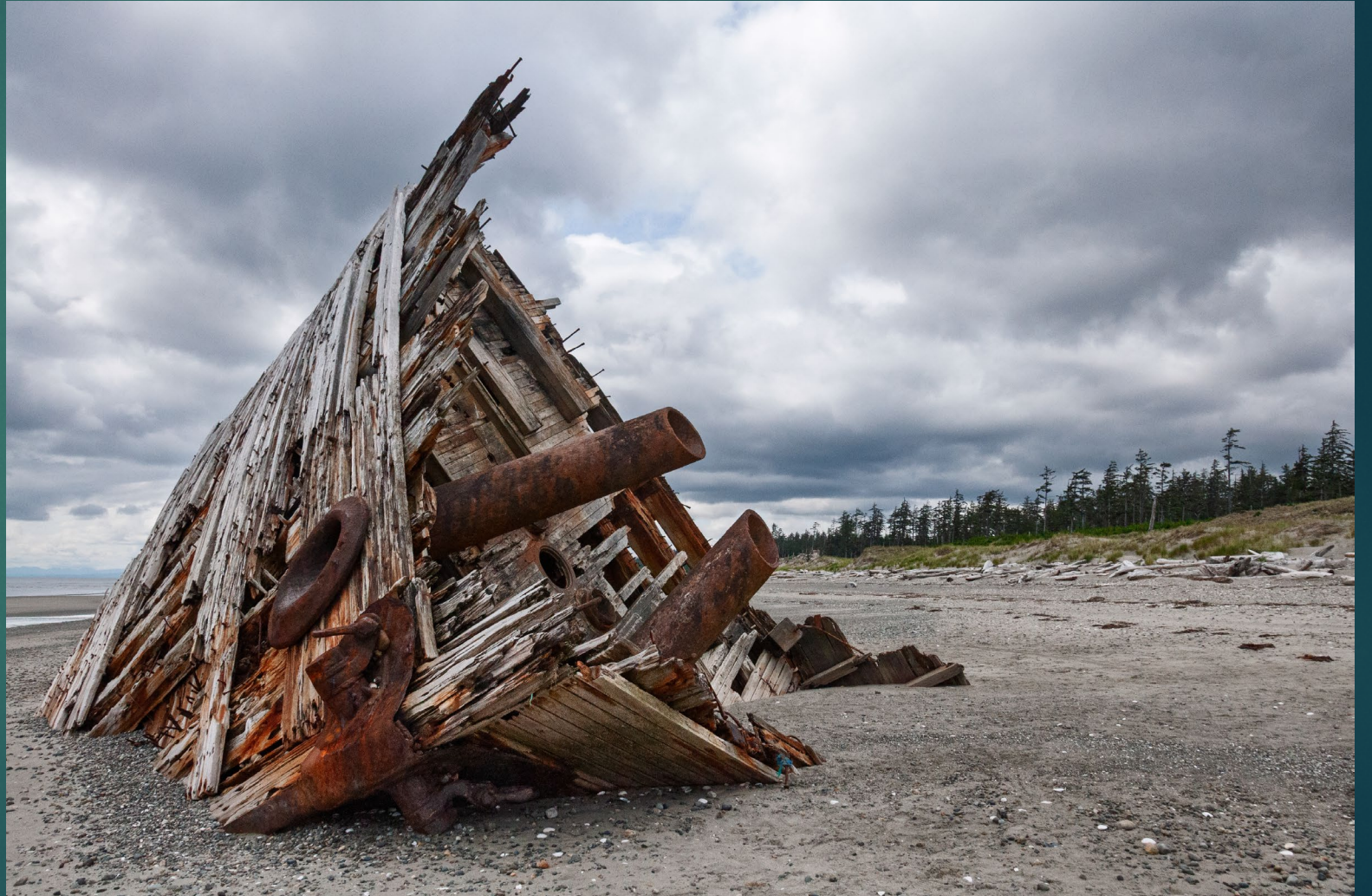
Pesuta Wreck, Tlell, Graham Island, Haida Gwaii, BC – July 2010