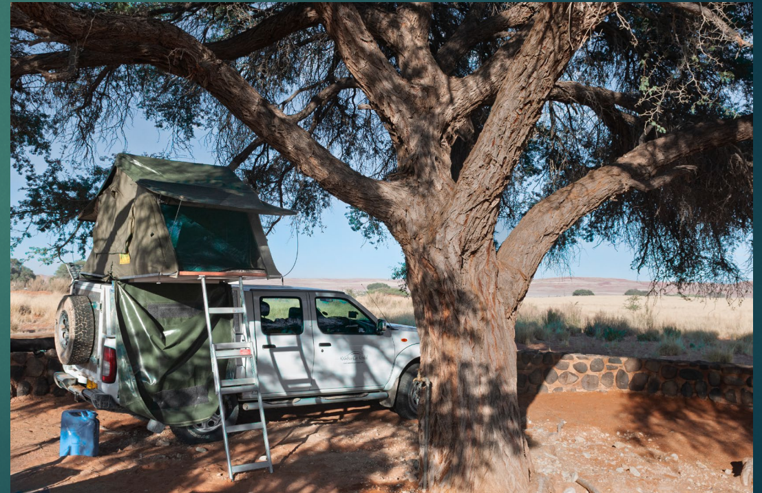
Camping, Namib-Naukluft National Park, Namibia – November 2011.