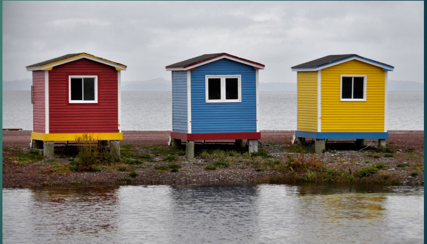
Fishing Stages, Cavendish, NL - 2016