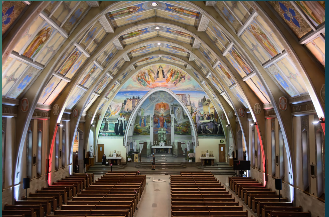
Sainte-Amélie Church, Baie-Comeau, QC – July 2024