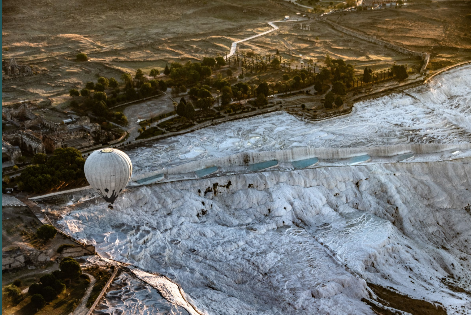
Travertine Pools, Pamukkale, Turkey - 2023