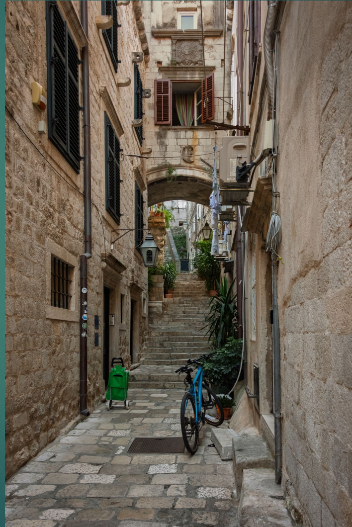
Dubrovnik Side Street, Croatia – September 2025.