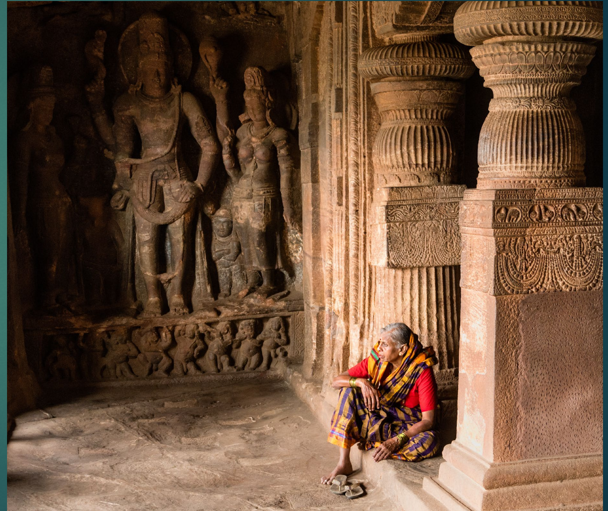
Old Woman at Cave Temples, Badami, Karnataka, India – March 2016.