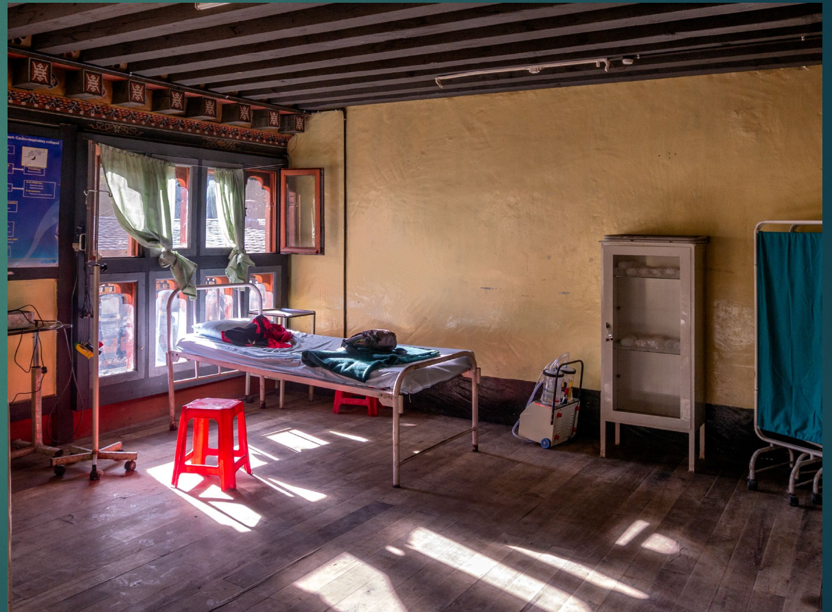
Hospital Room, Bumthang, Bhutan – October 2014.