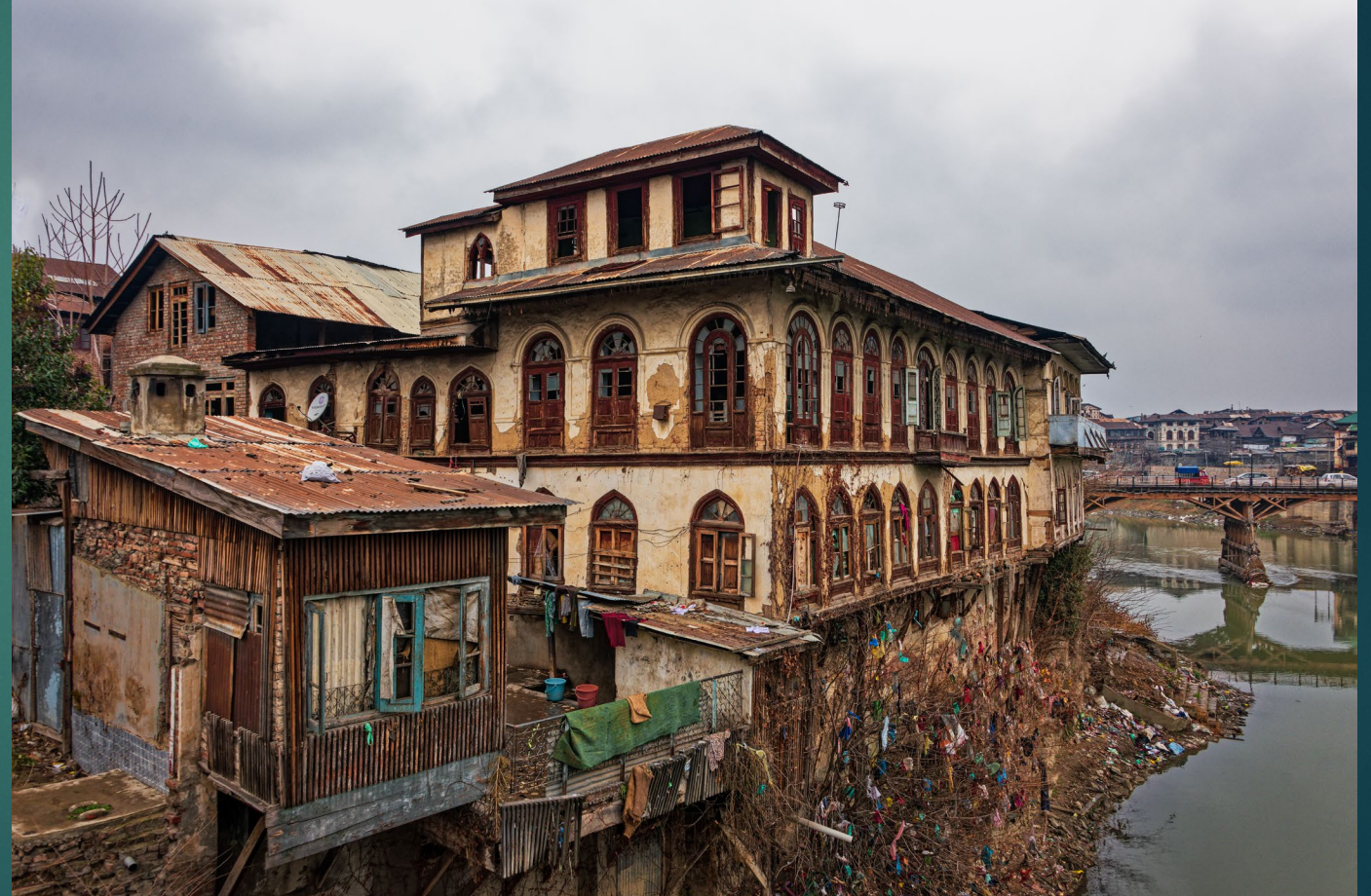
Old House – Old Srinigar, Kashmir, India – January 2023.