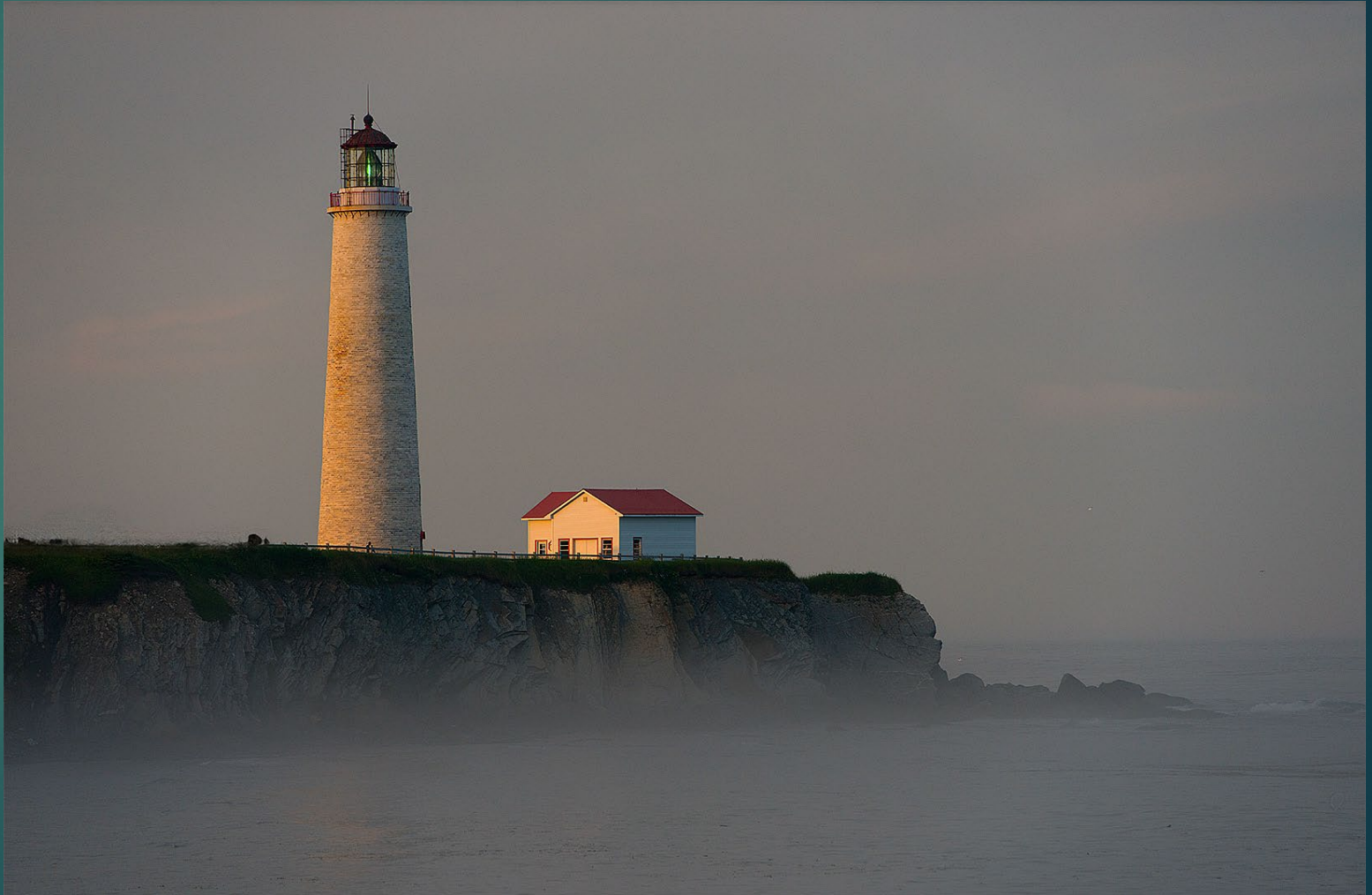
Cap-des-Rosiers Lighthouse, Gaspé, Quebec – July 2012.