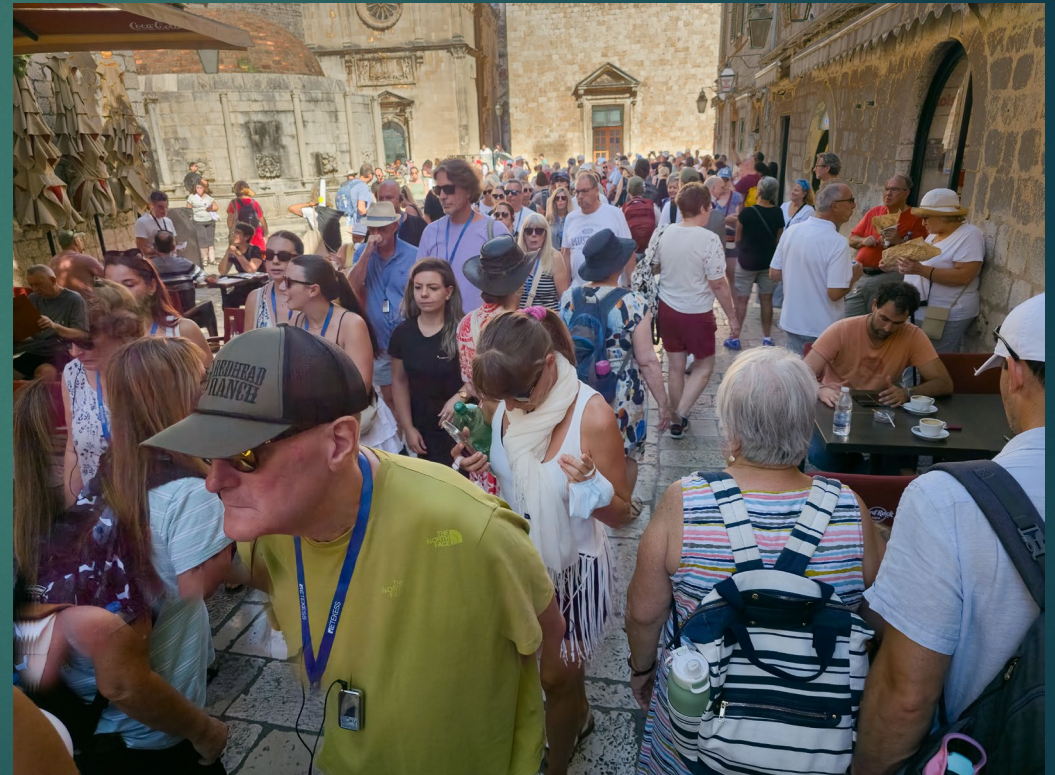
Old Town – Dubrovnik, Croatia – September 2025.