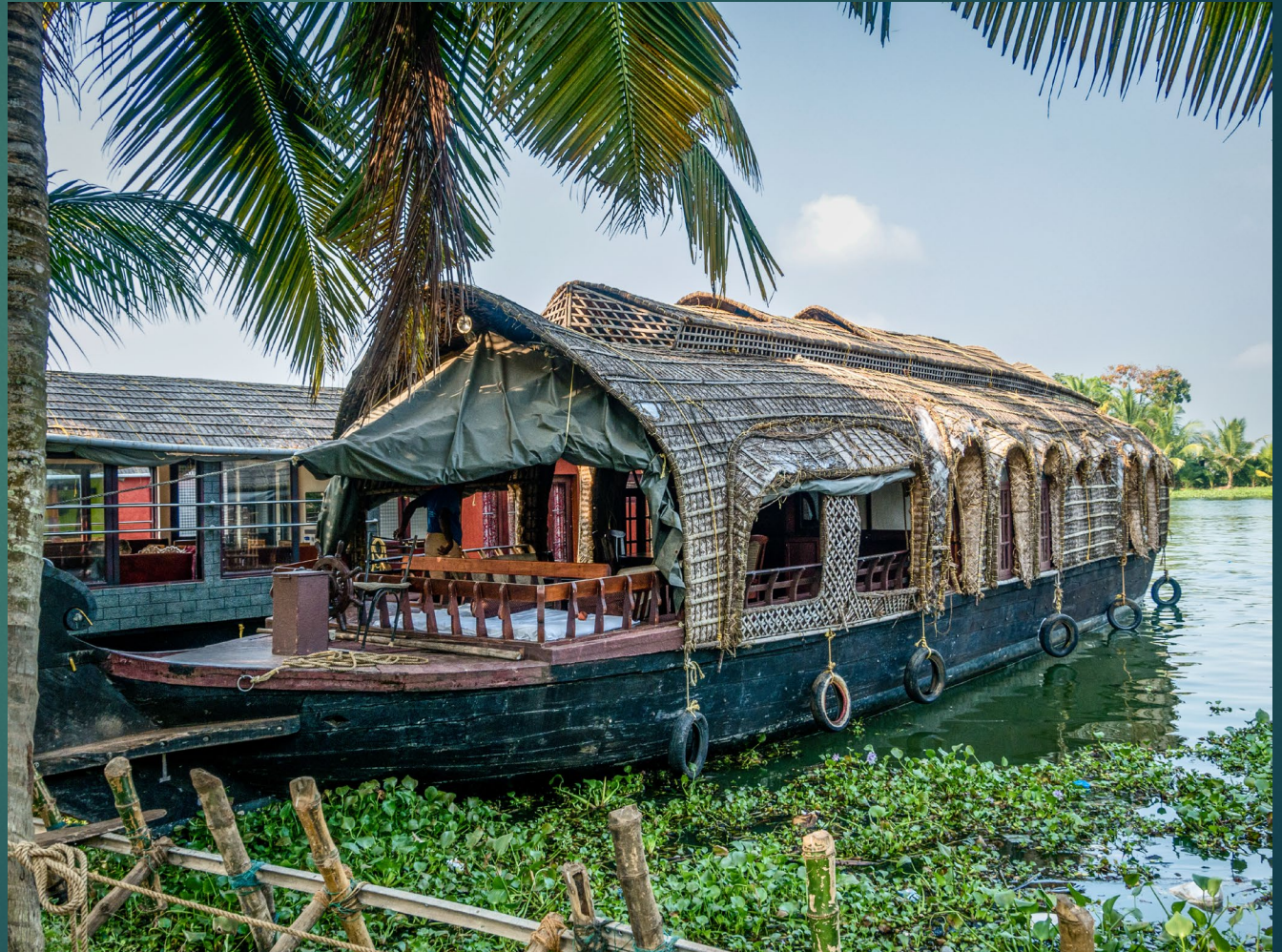
Houseboat, Alleppey, Kerala, India – February 2016