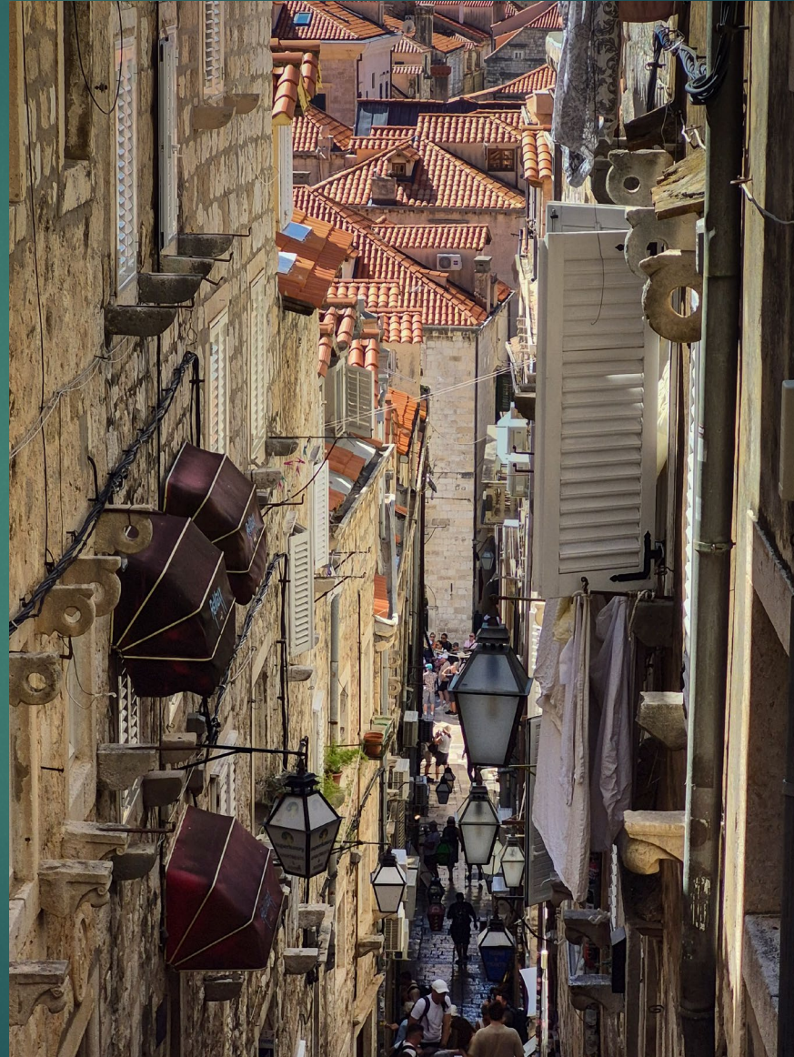
Dubrovnik Street, September 2025