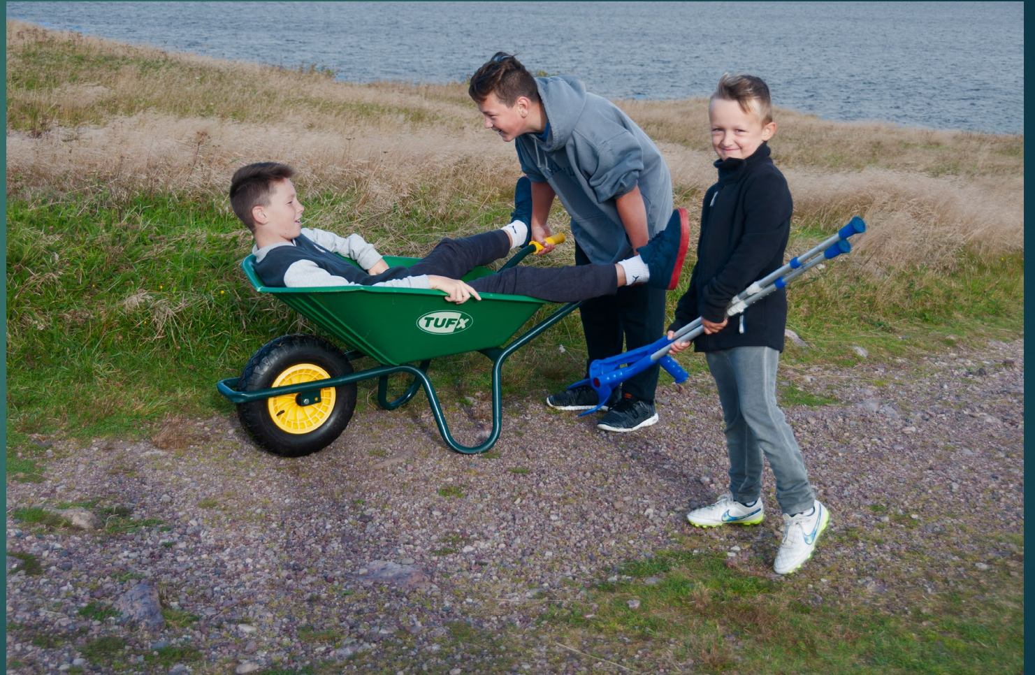
Three Boys, Île aux Marins, Saint Pierre et Miquelon, France – September 2016