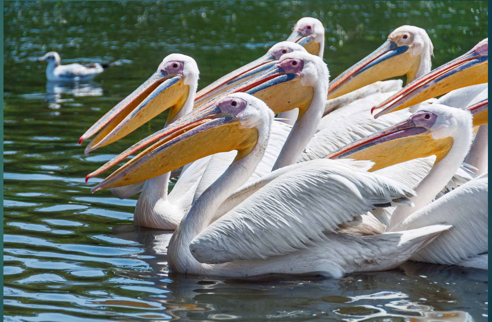
Pelicans, Lake Chamo, Arba Minch, Ethiopia – November 2013