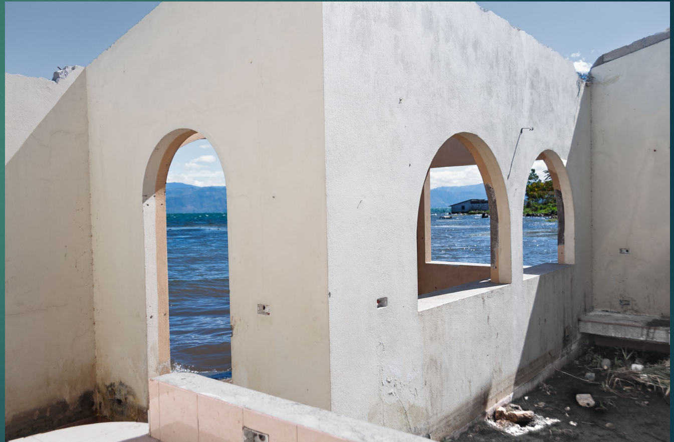
Abandoned House – St Pedro la Laguna, Guatemala – February 2014