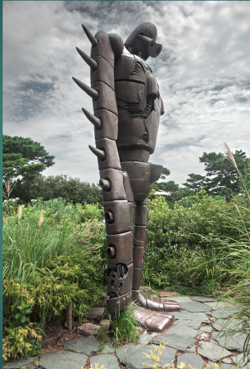
Gardener Robot, Ghibli Museum, Tokyo, Japan – August 2015