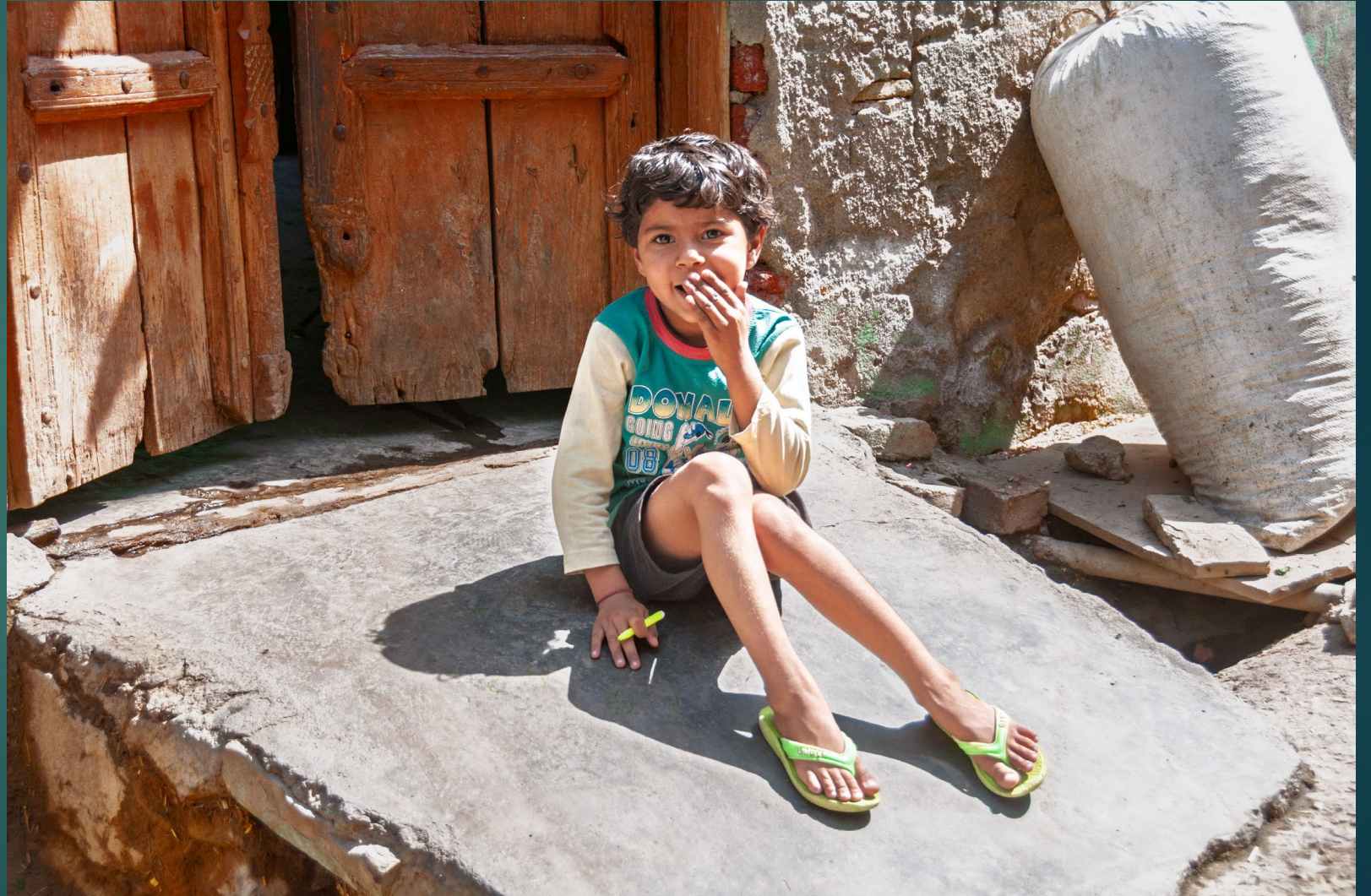
Sitting child, Nandgaon, Uttar Pradesh, India – March 2017