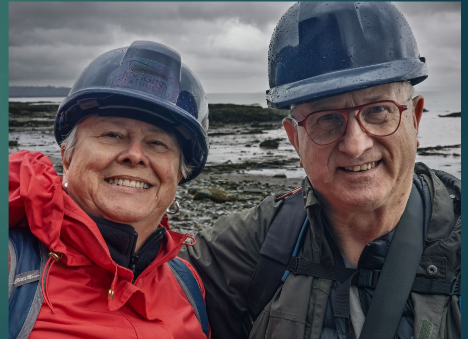
Joggins Fossil Cliffs, Nova Scotia – October 2025