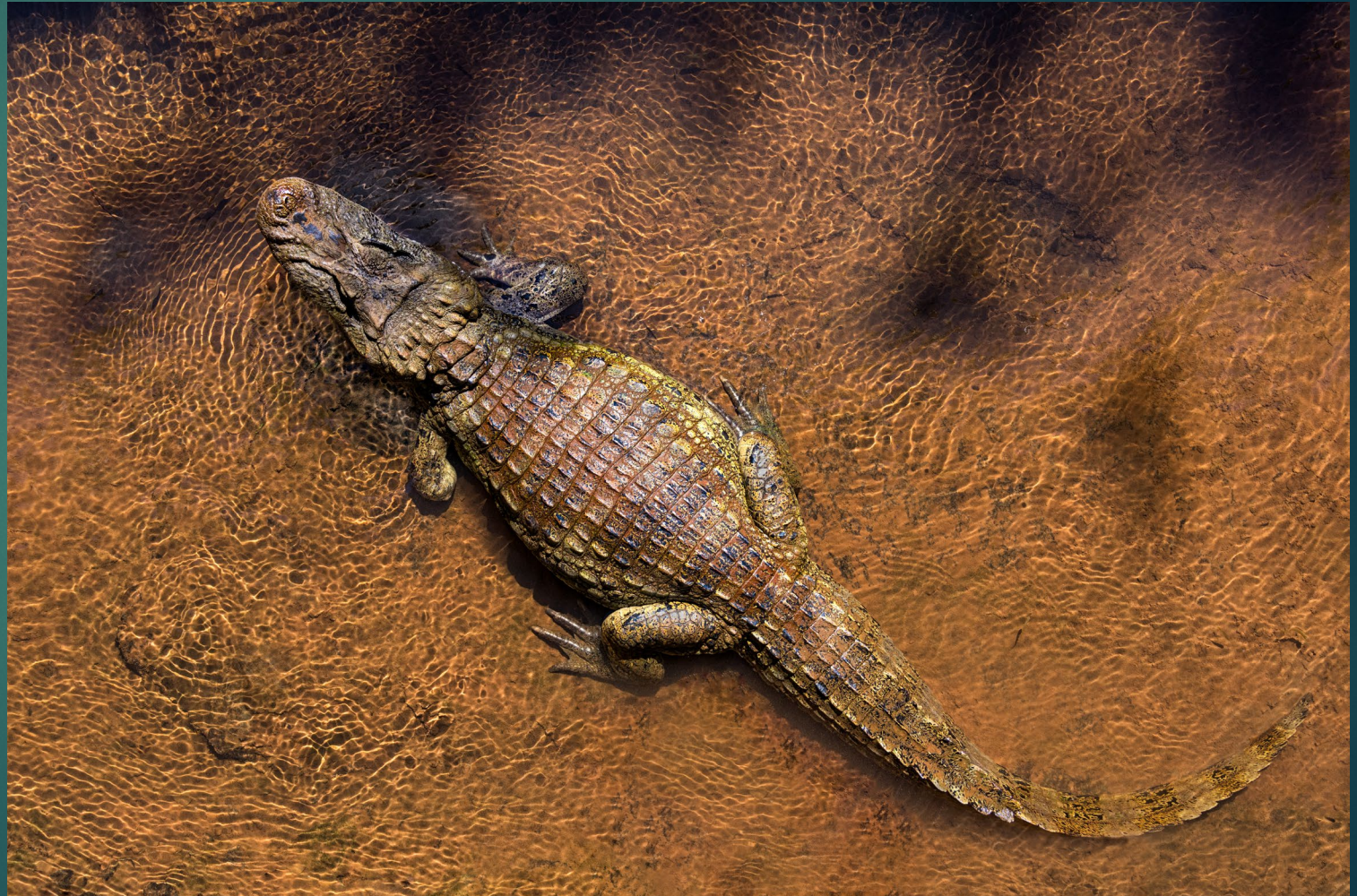
Caiman, Iguazu Falls, Argentina – February 2019.