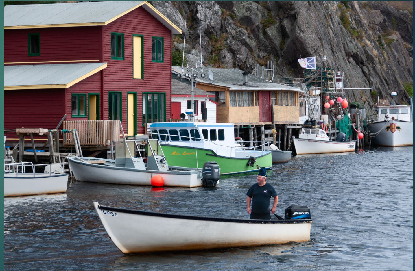
Quidi Vidi, NL – September 2016