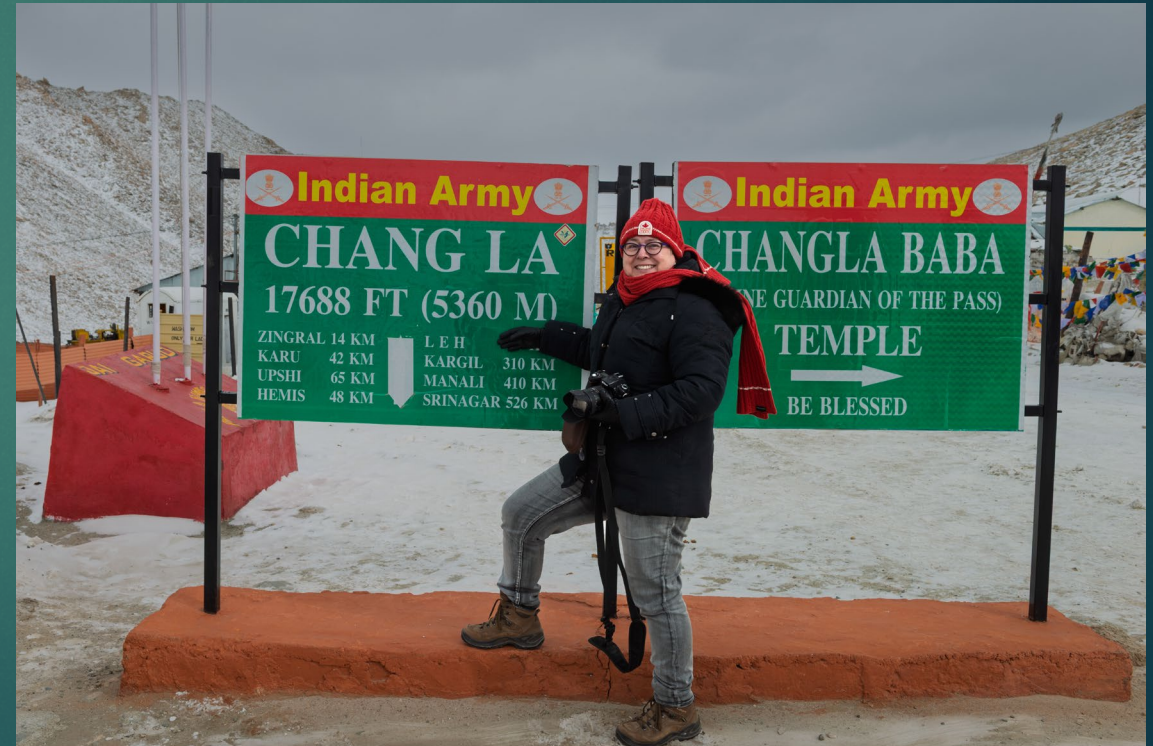
Chang La Pass, Ladakh, India – January 2017.