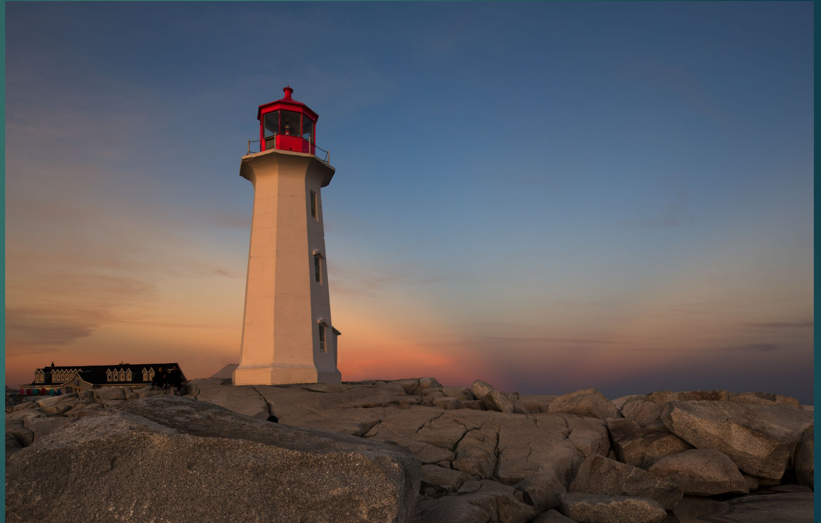
Lighthouse, Peggy's Cove, NS – September 2022.