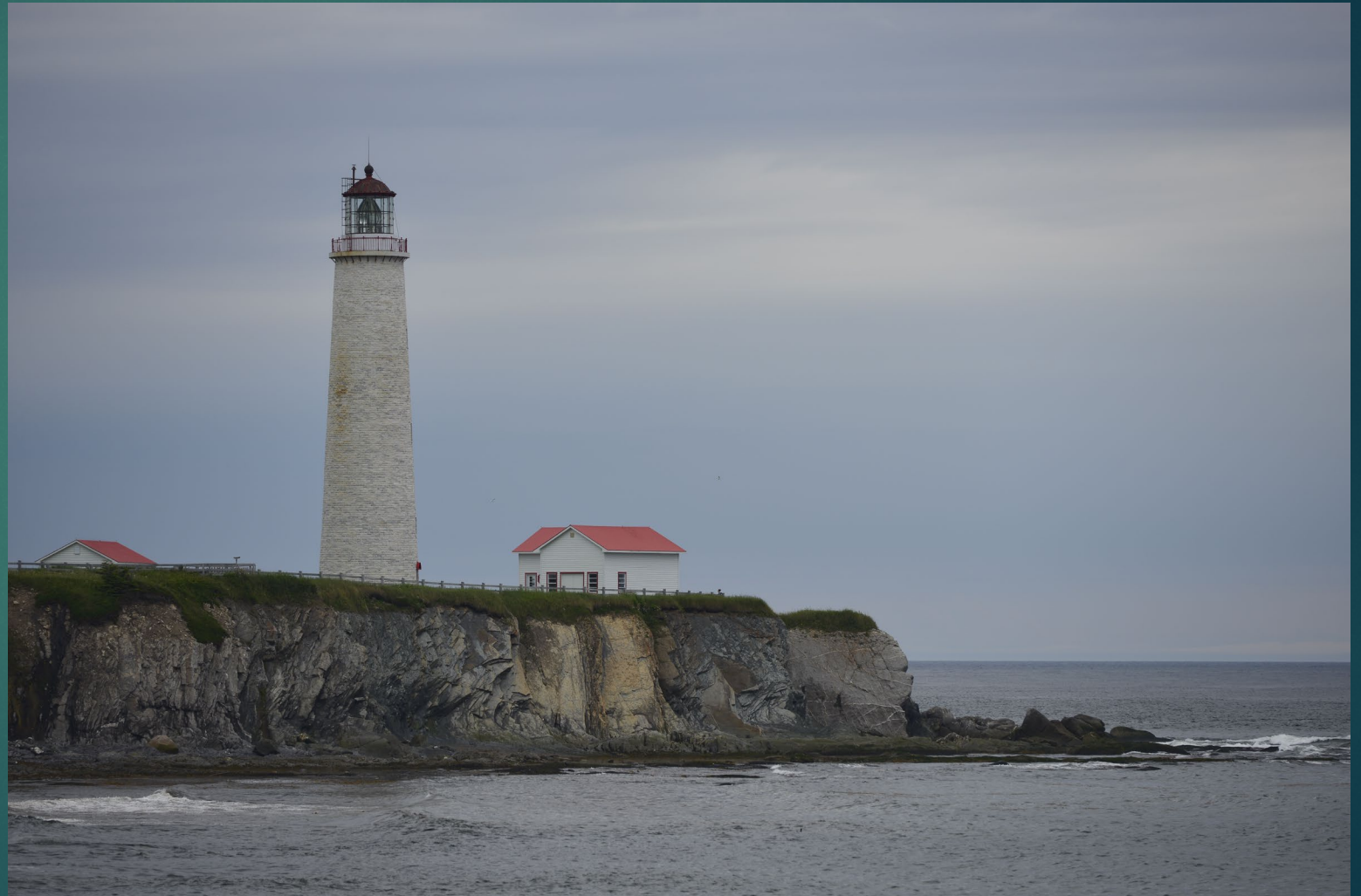
Cap-des-Rosiers Lighthouse, Gaspé, Quebec – July 2012.