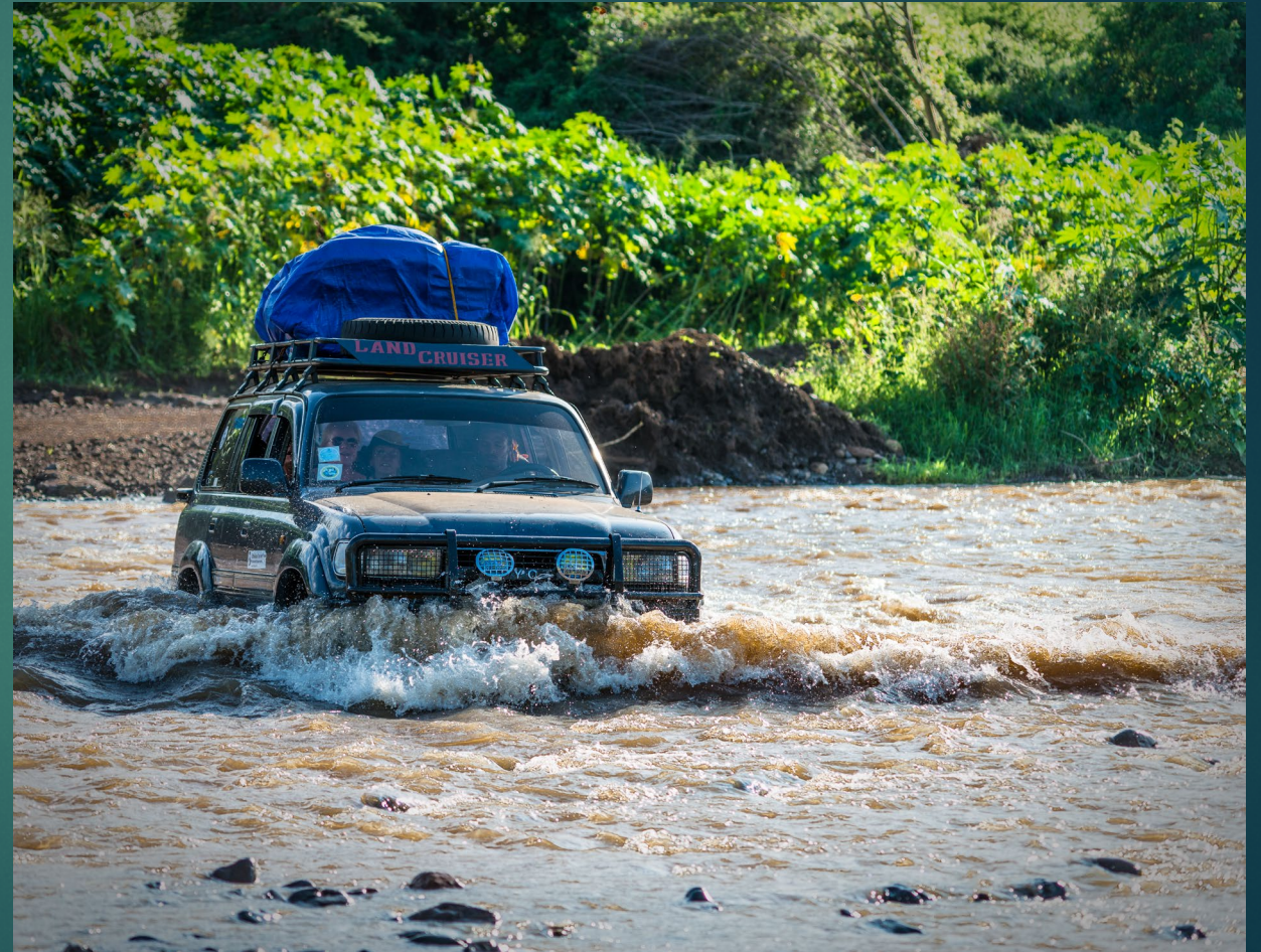
Successful River Crossing, Southern Ethiopia – November 2023.