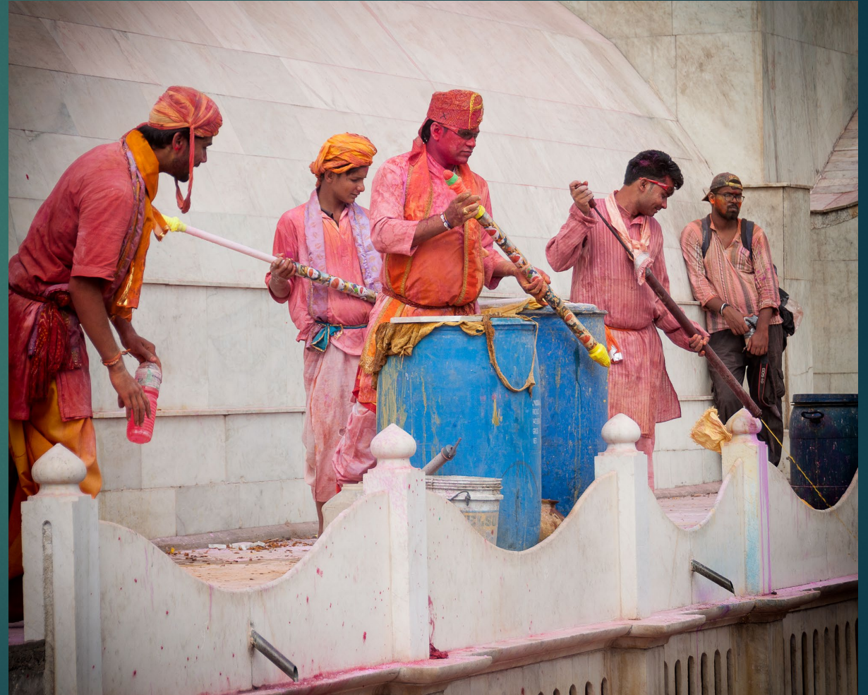
Lathmar Holi, Nandgaon, Uttar Pradesh, India – March 2017