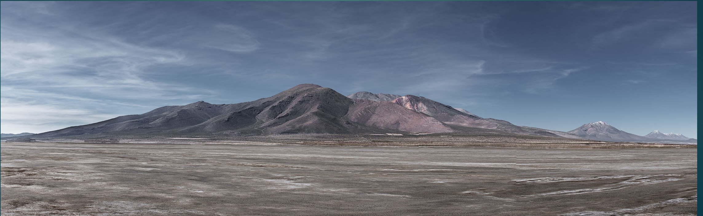
Salar de Chiguana, Bolivia – February 2019.