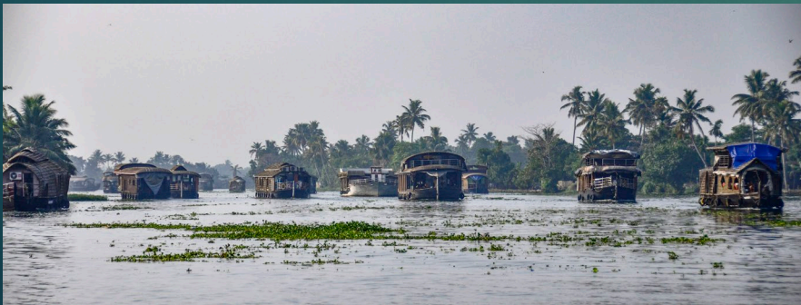
Houseboats, Backwaters, Kerala, India – February 2016