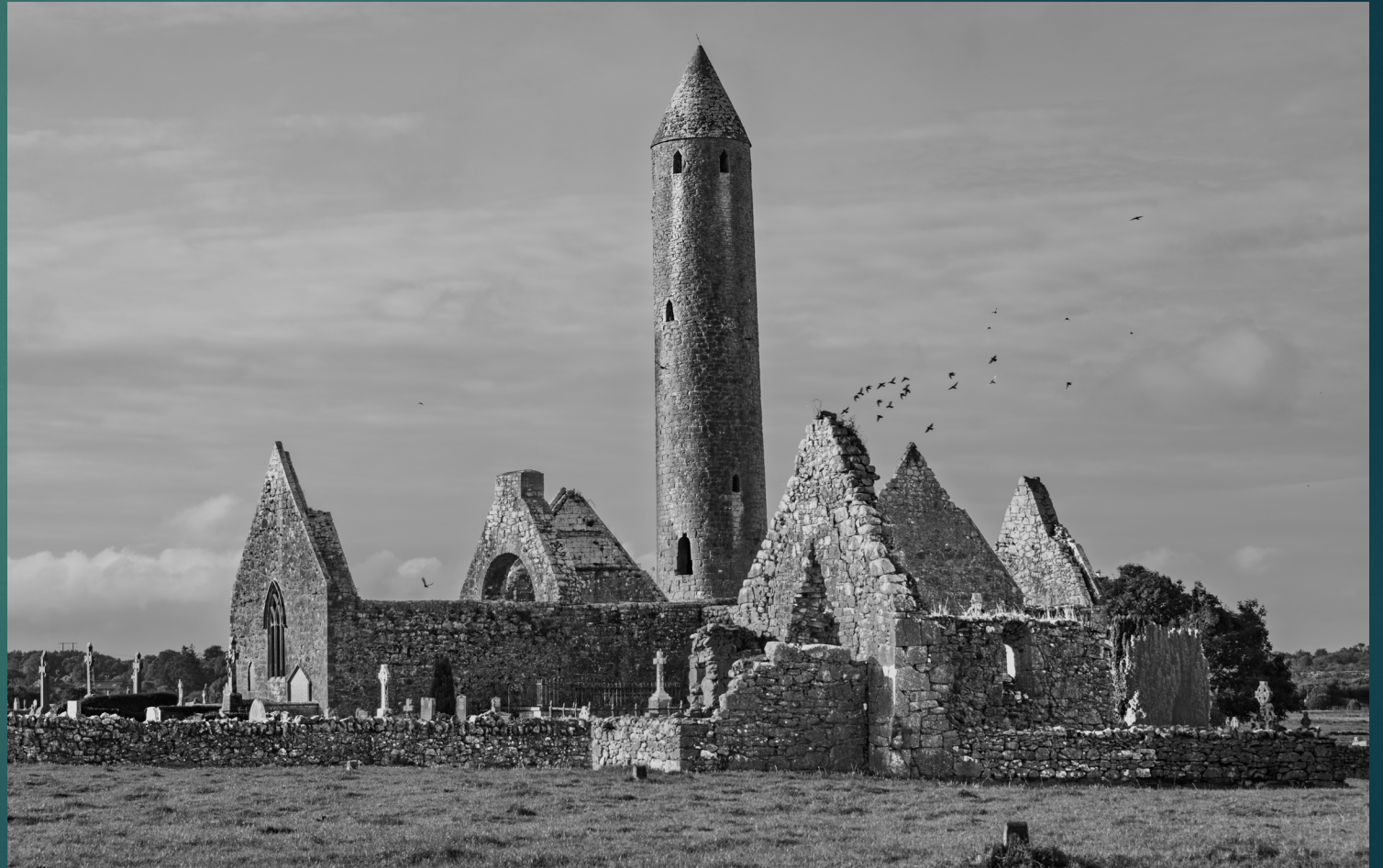
Kilmacdaugh Monastery, Gort, County Galway, Ireland – October 2024.