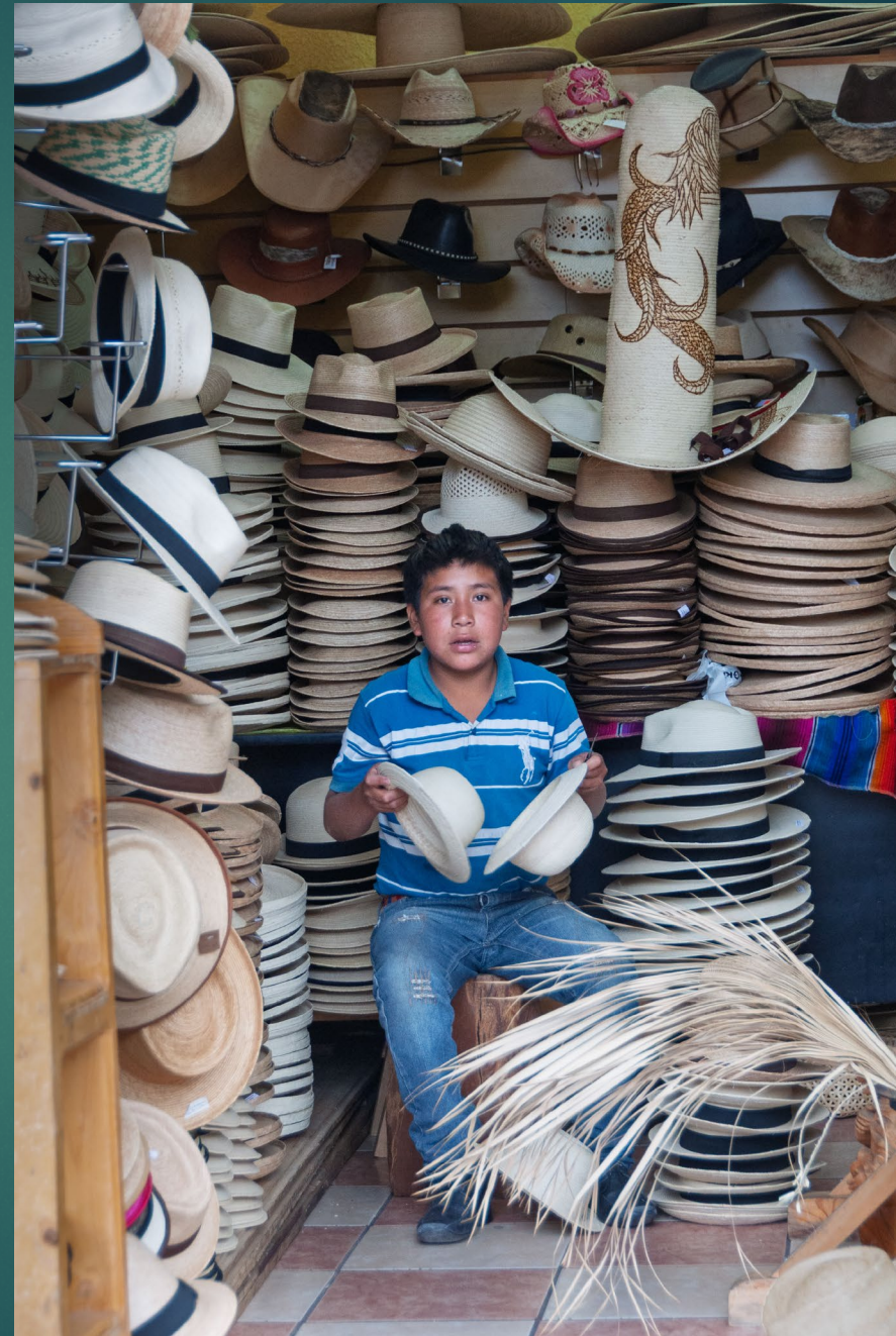
Hat Shop, Panajachel, Lake Atitlan, Guatemala – February 2014