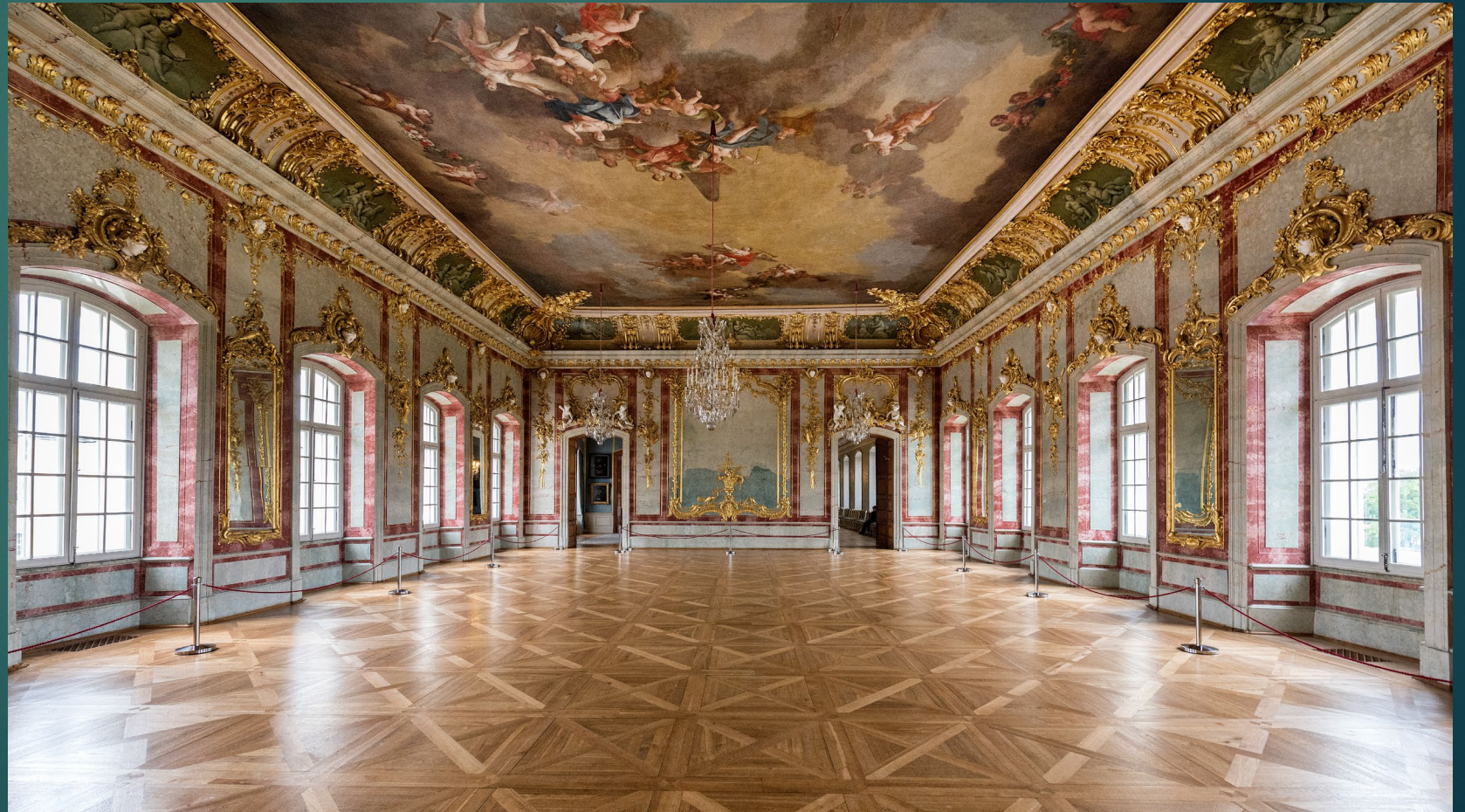
Rundale Palace, Bauska Municipality, Latvia – September 2017.