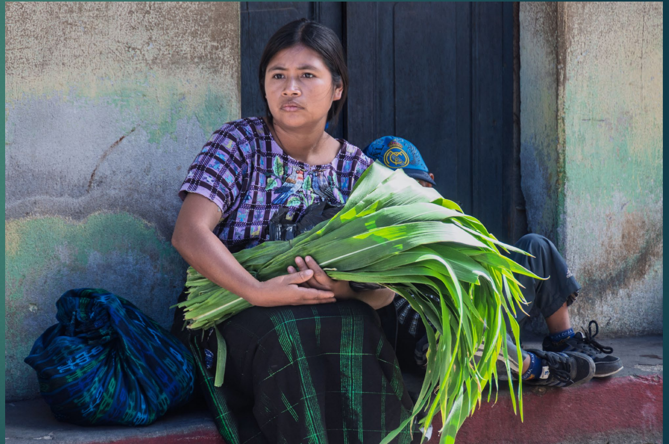
Selling Banana Leaves, St Pedro la Laguna, Guatemala – February 2014