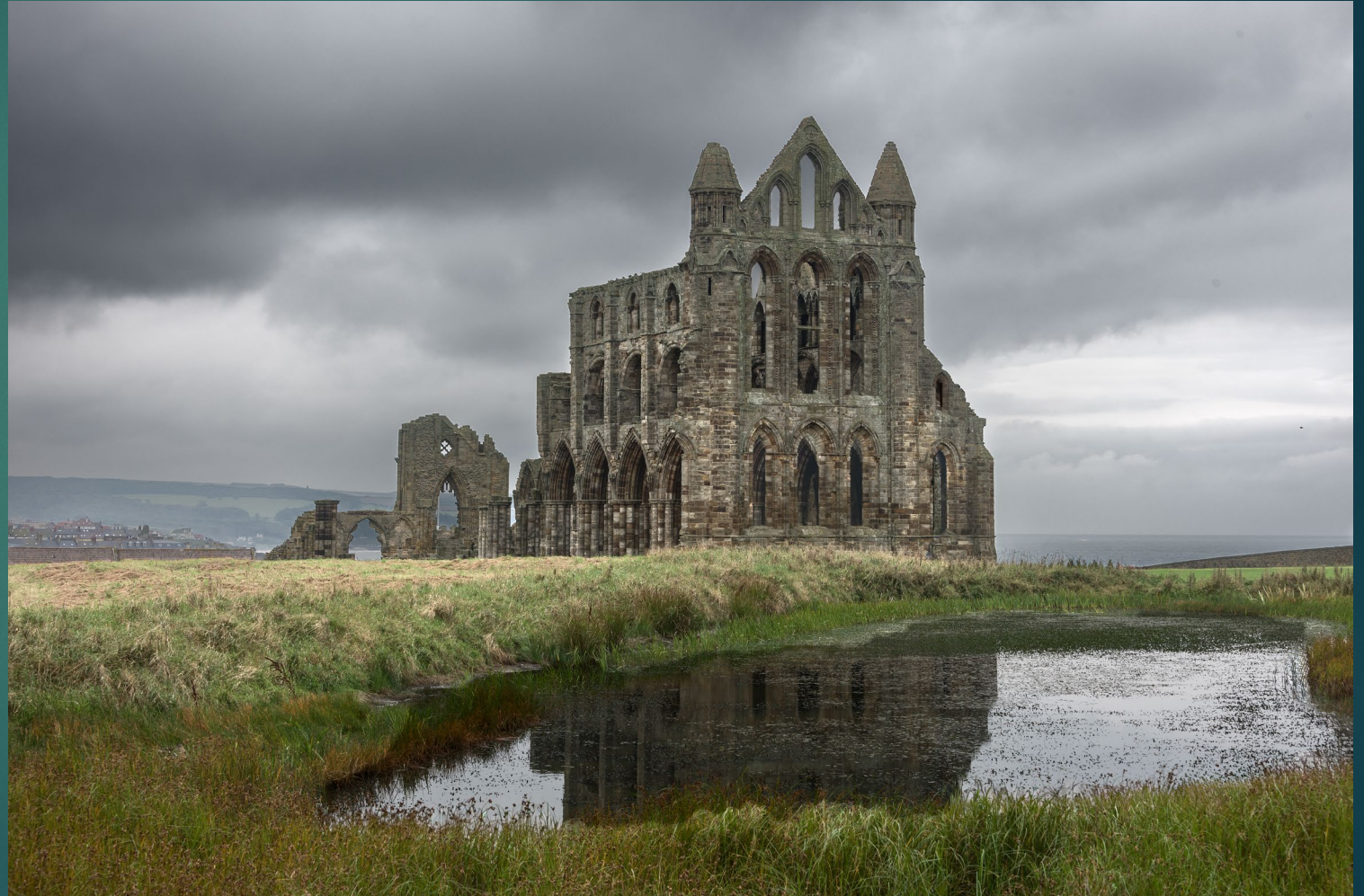
Whitby Abbey, Whitby, North Yorkshire, England – September 2024.