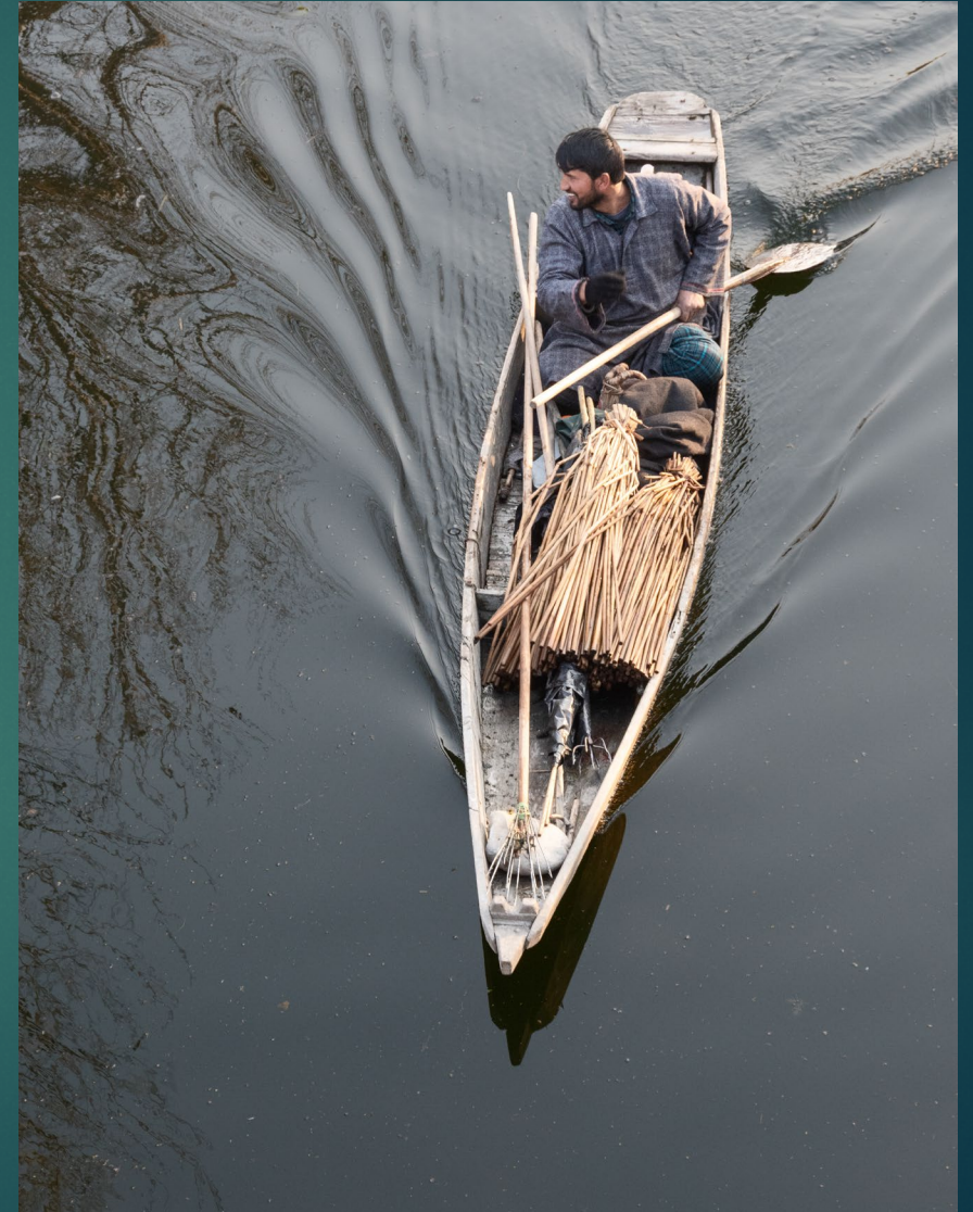
Heading Home, Srinagar, Kashmir, India – January 2023