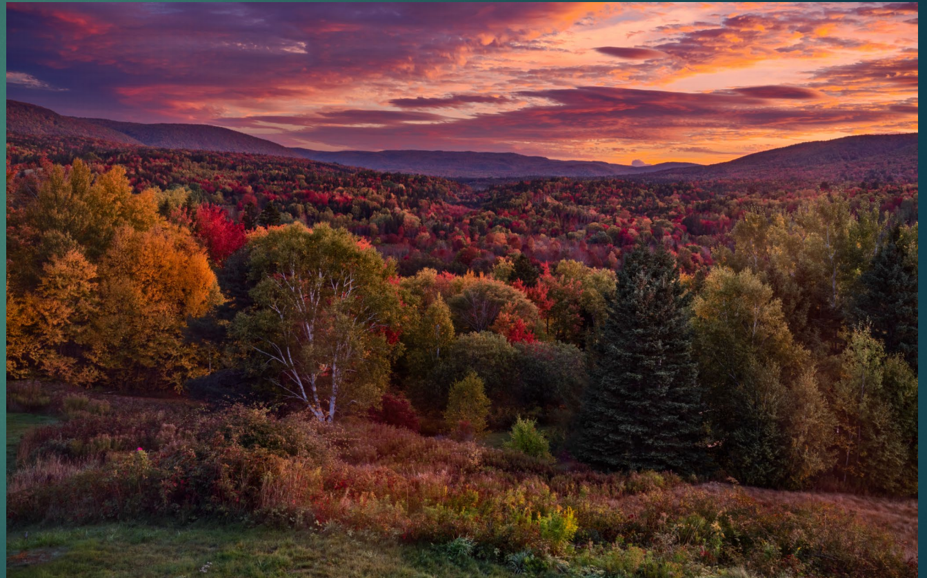
Cabot Trail Sunrise, Baddeck, Nova Scotia – October 2025.