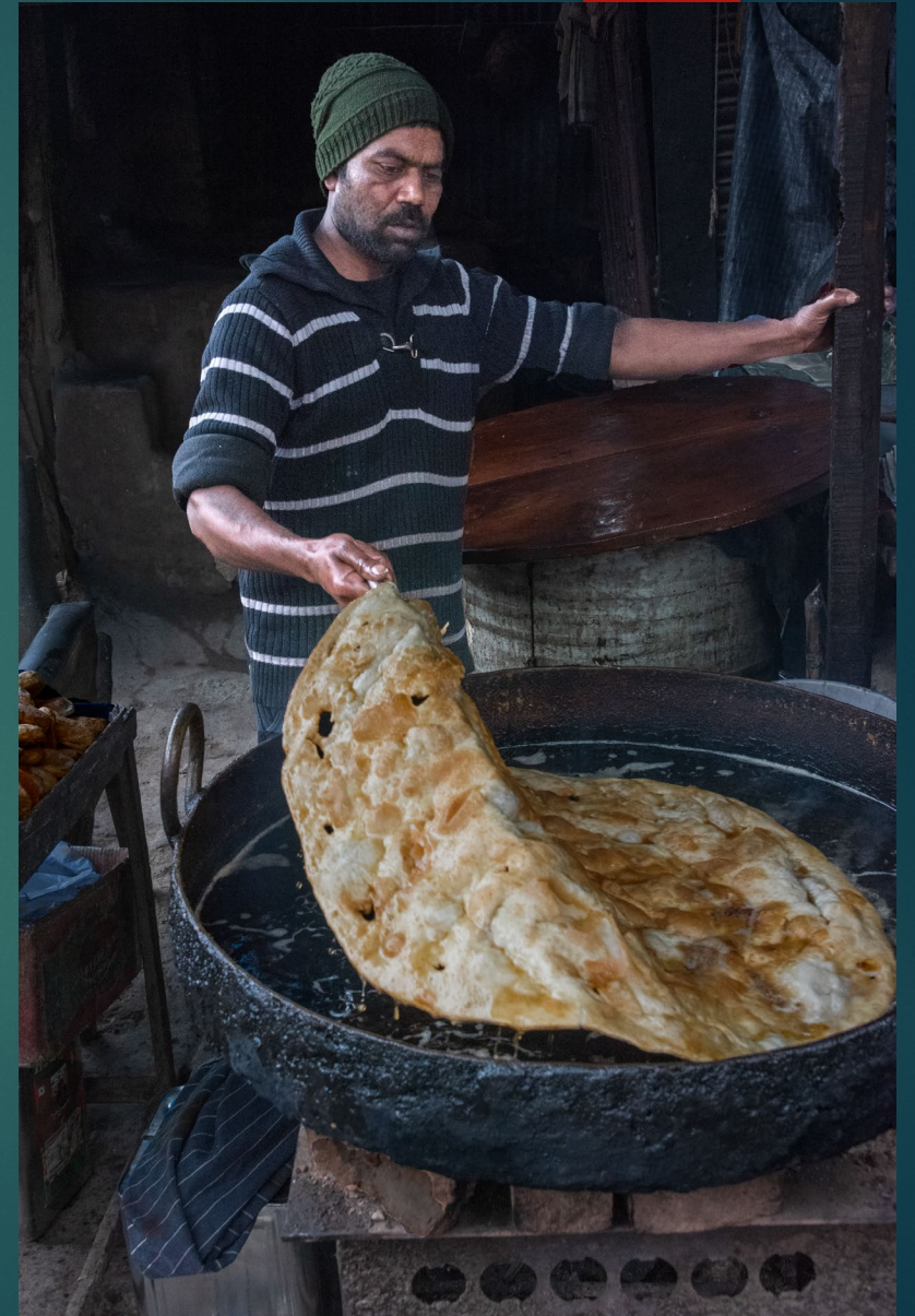
Street Food, Srinigar, Kashmir, India – January 2023.