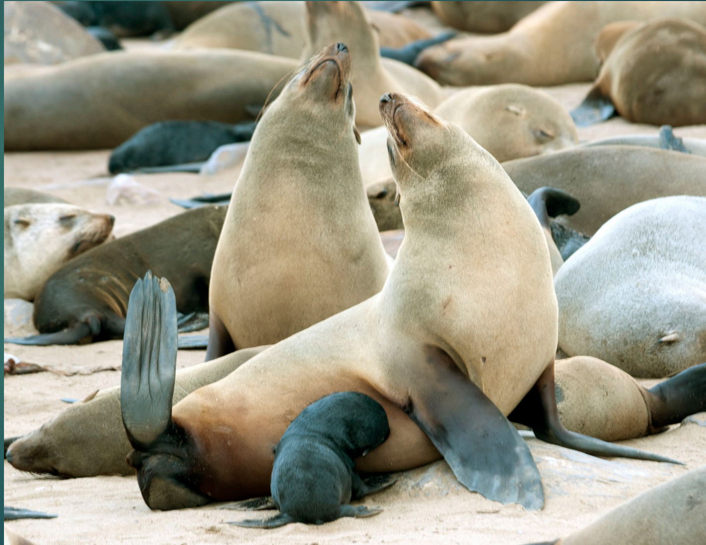
Cape Fur Seals, Cape Cross, Namibia – November 2011.