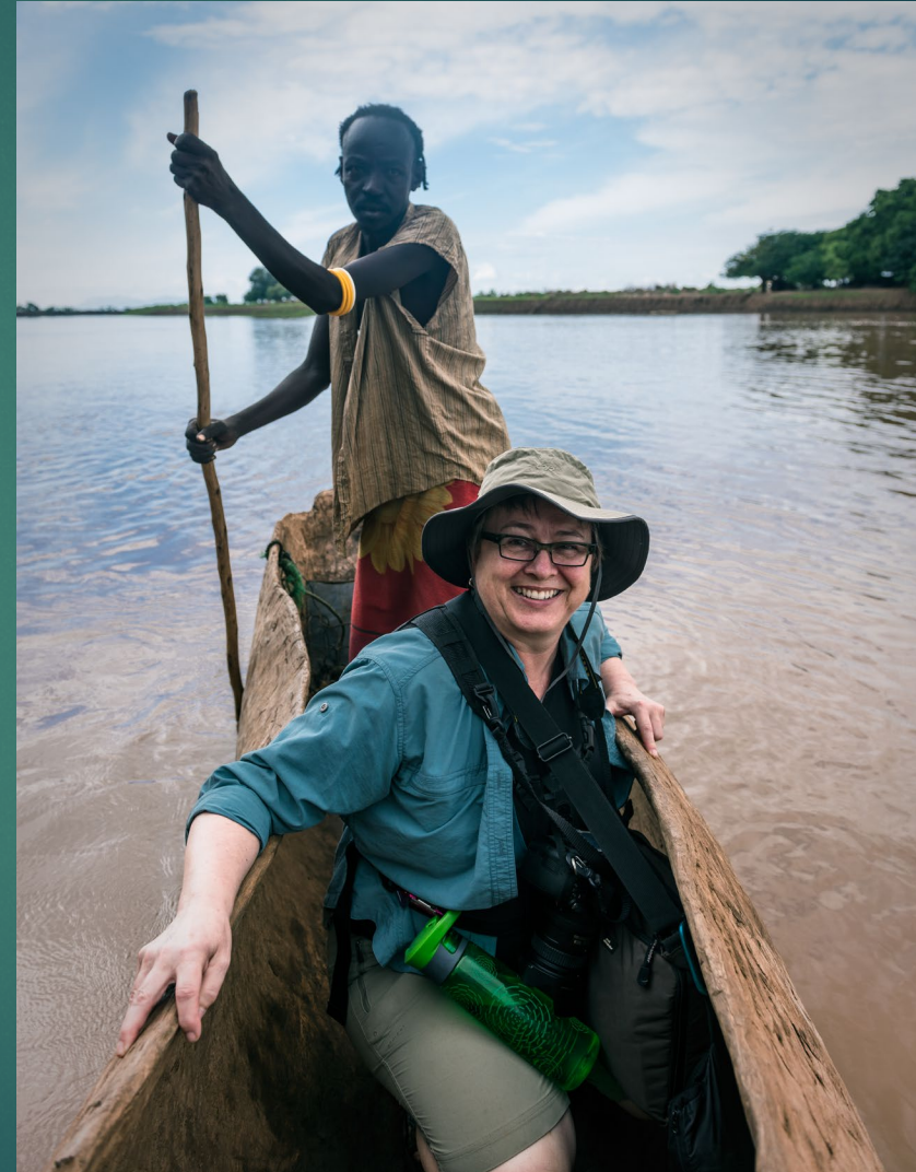
Crossing the Omo River, Ethiopia – November 2013.