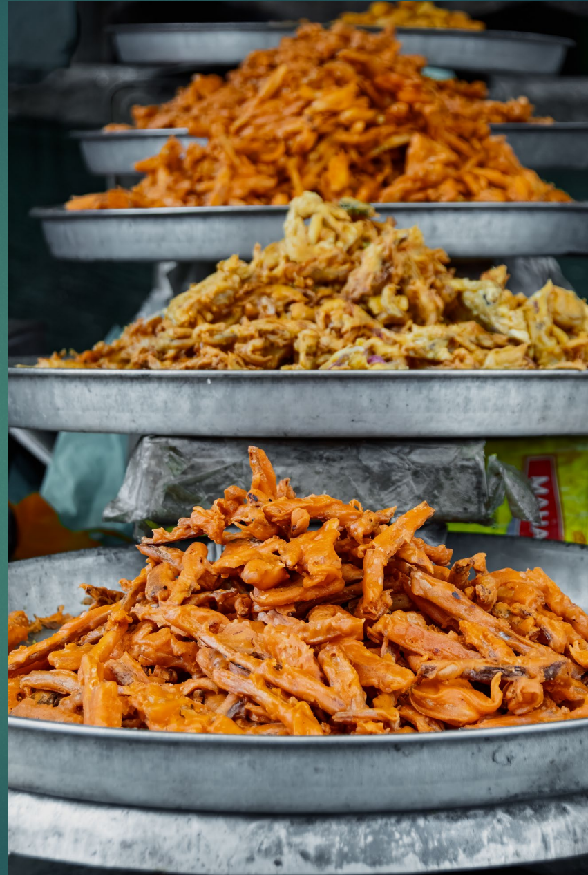
Street Food, Srinigar, Kashmir, India – January 2023