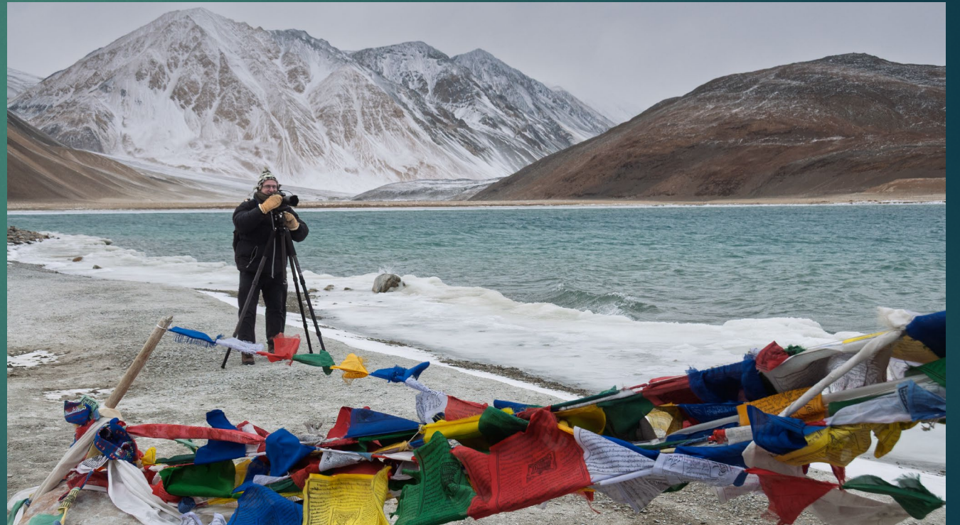
Pangong Lake, Ladakh, India – January 2017