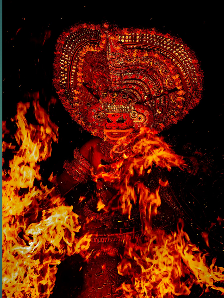
Fire Theyyam, Kerala, India – February 2023.