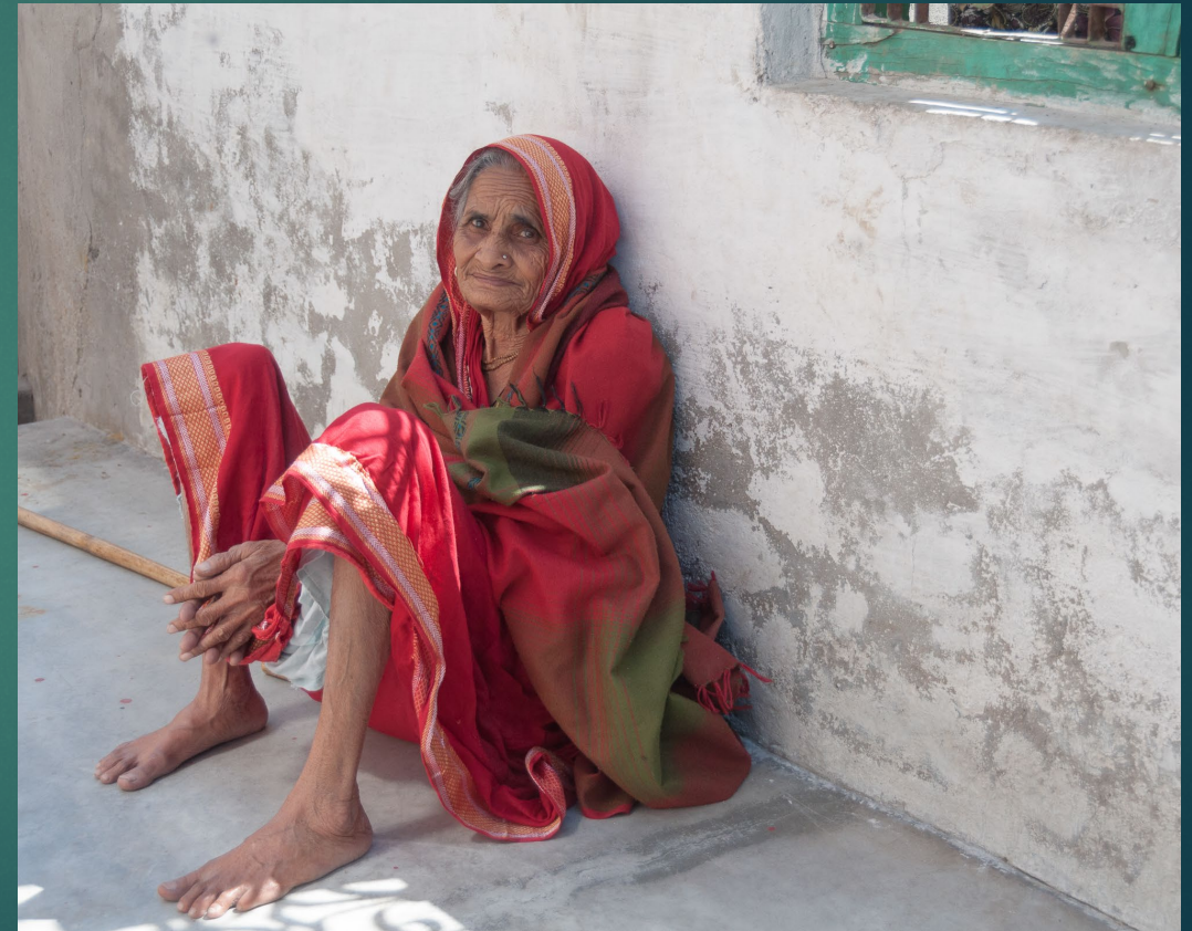
Old Woman, Nandgaon, Uttar Pradesh, India – March 2017