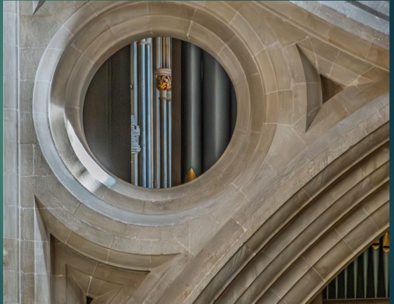
Details – Scissor Arch, Wells Cathedral, Somerset, England – September 2024