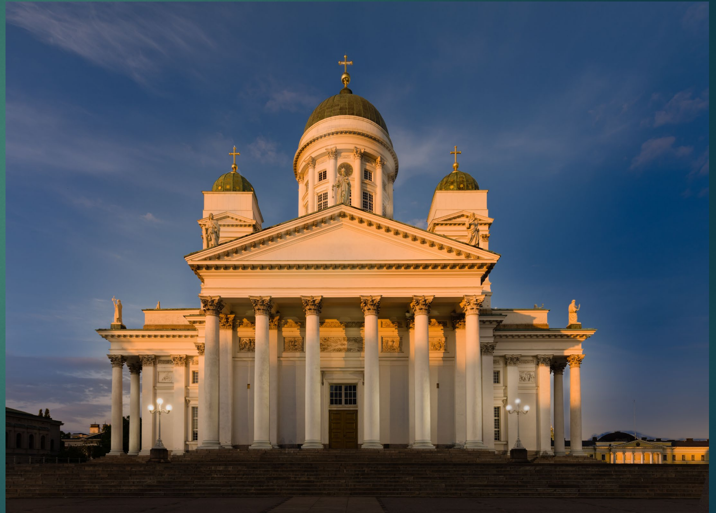
Helsinki Cathedral, Finland – May 2016.