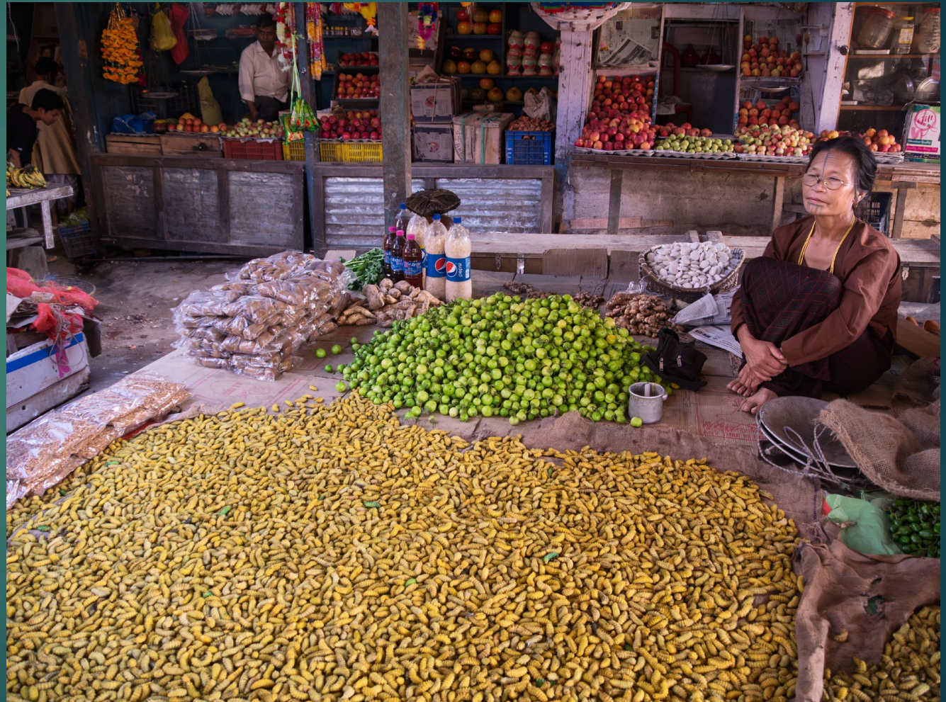
Market, Ziro, Arunachel Pradesh, India – October 2014.