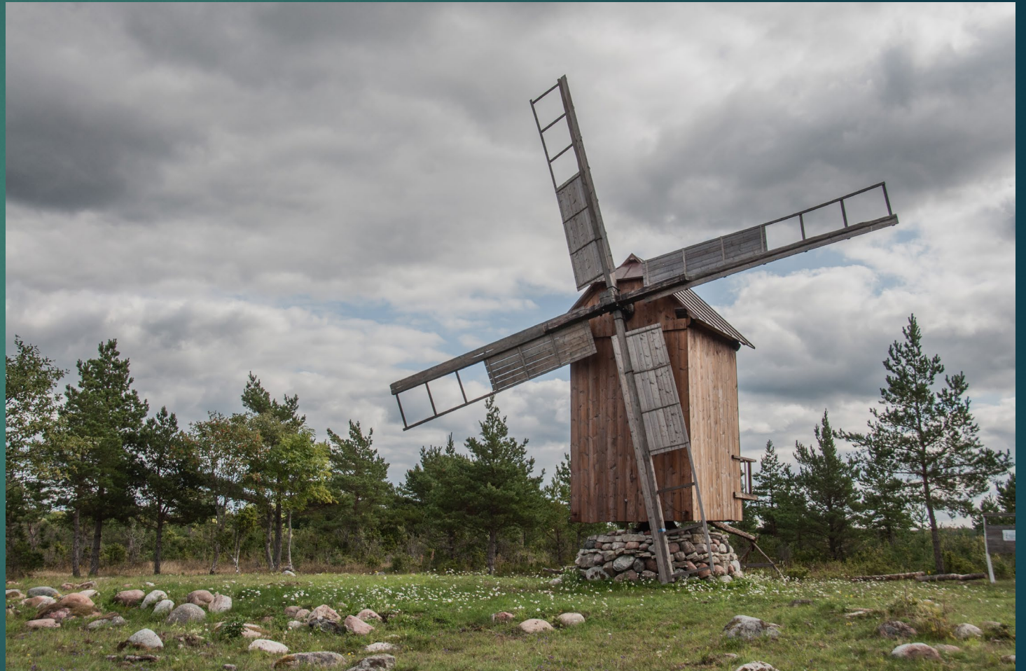
Windmill, Saaremaa Island, Estonia – September 2017