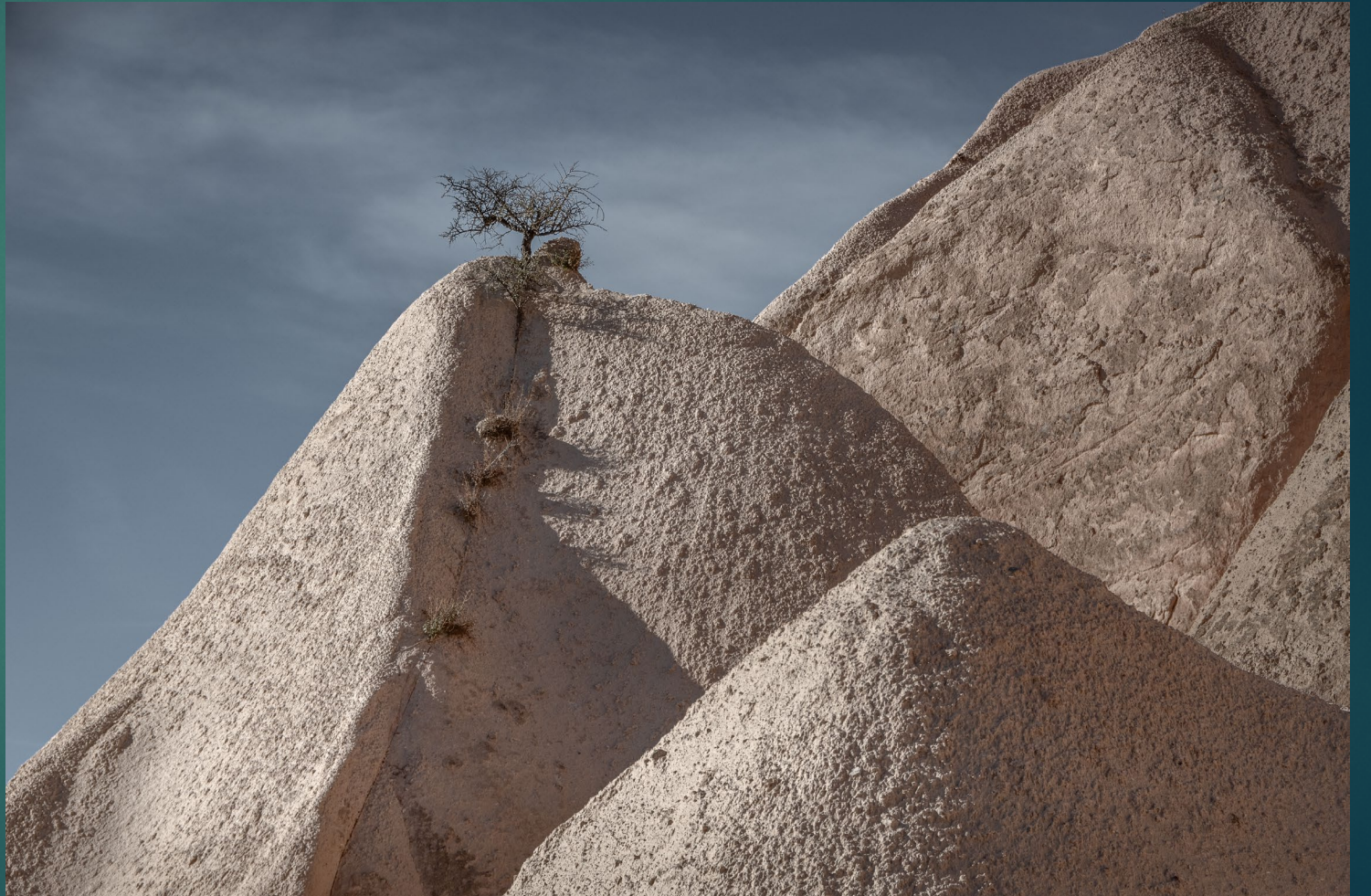
Cappadocia, Turkey, November 2023