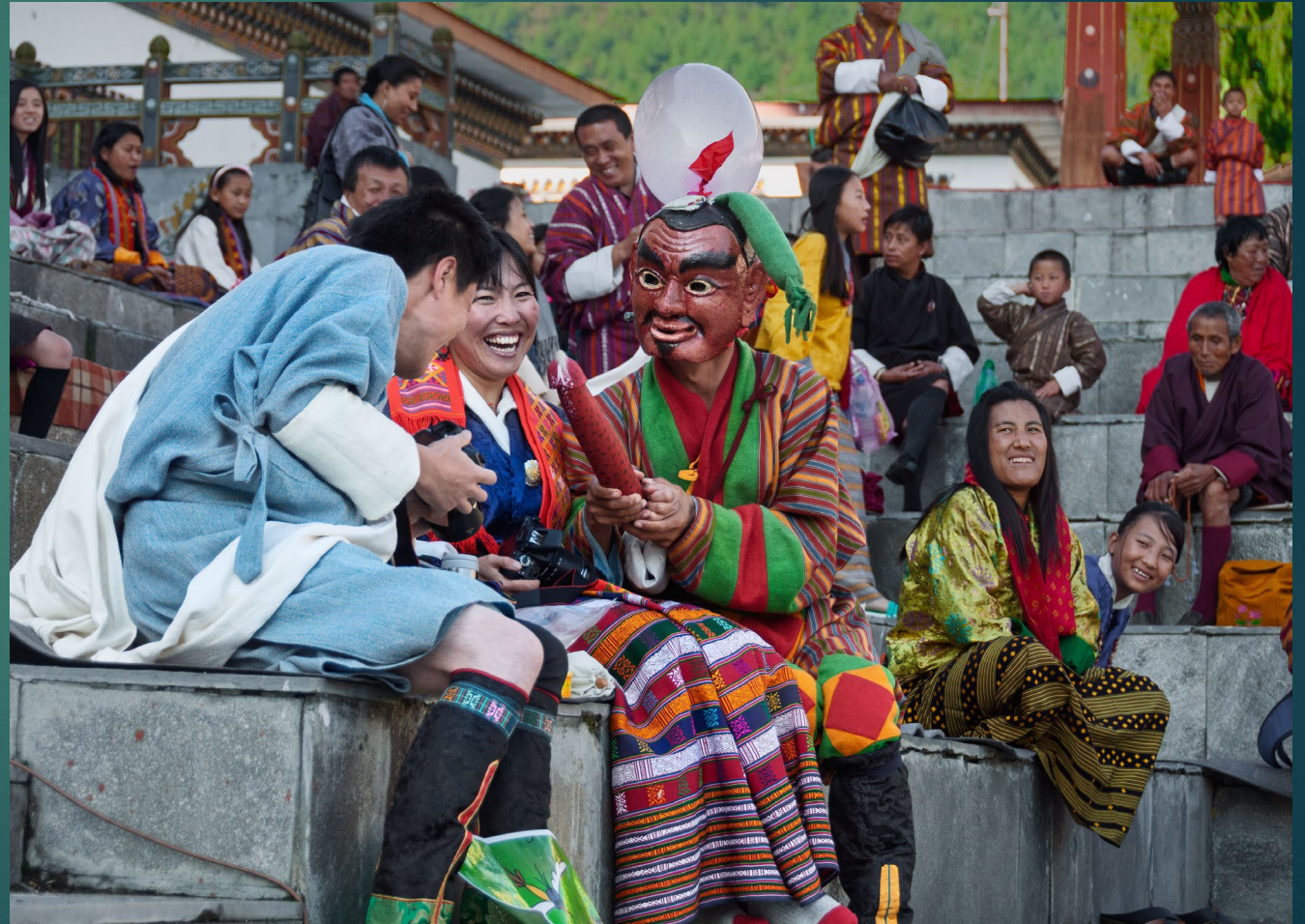
Tshechu Festival, Thimpu, Bhutan – October 2024