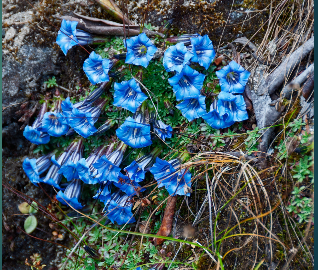
Himalayan Gentian, Bhutan – October 2014